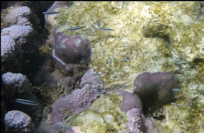
Thalassoma amblycephalum juvenile 2012 Chumbe Island, Zanzibar