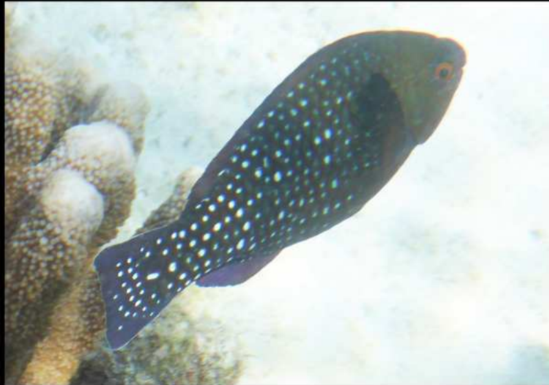
Scarus prasiognatos Grünwangen-Papageifisch Greenthroat parrotfish female 2022 Chumbe Island, Zanzibar