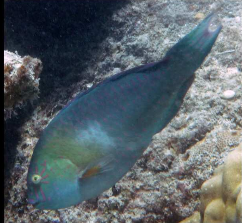
Calotomus carolinus male Stareye parrotfish or Carolines parrotfish Papageifisch 2013 Chumbe Island, Zanzibar