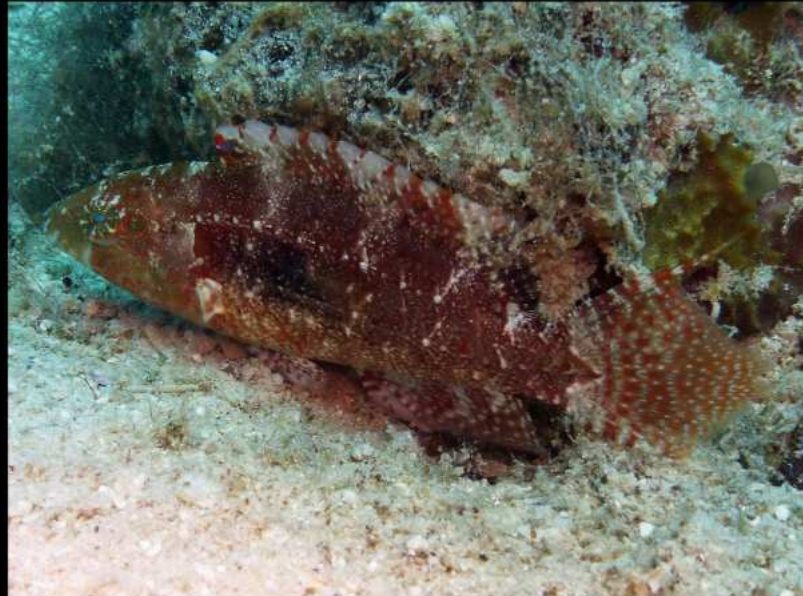
Oxycheilinus bimaculatus