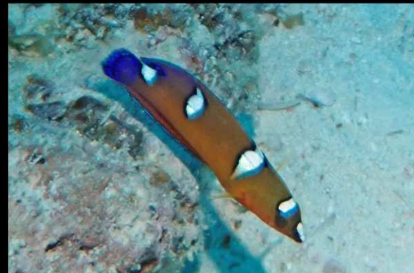
Coris cuvieri