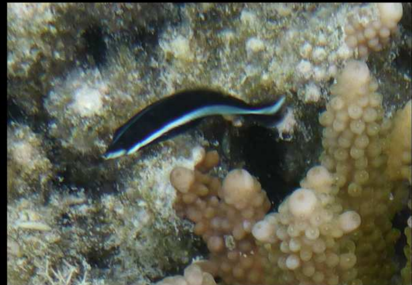
Labrichthys unilineatus Fransen-Putzerfisch juvenile 2016 Chumbe Island, Zanzibar Tubelip wrasse