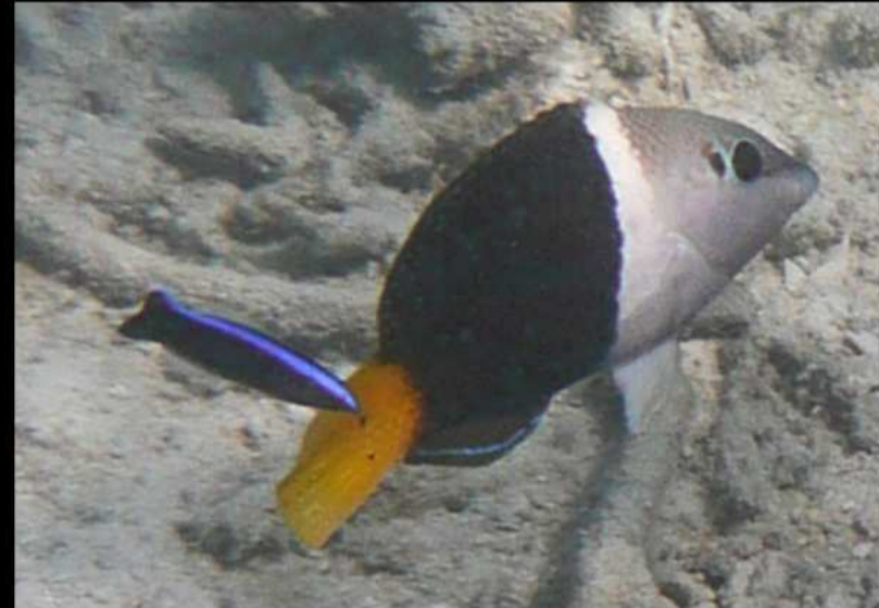
Hemigymnus melapterus