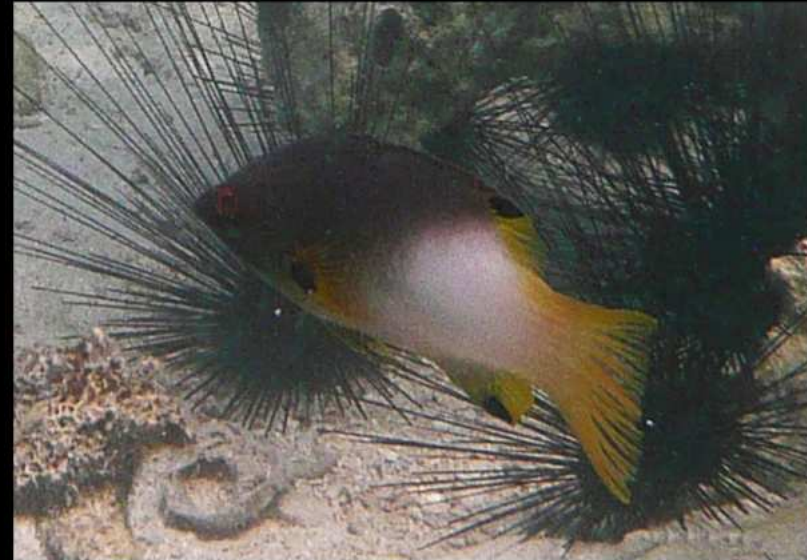
Bodianus axillaris Achselfleck-Schweinslippfisch Axilspot Hogfish 2009 Chumbe Island, Zanzibar