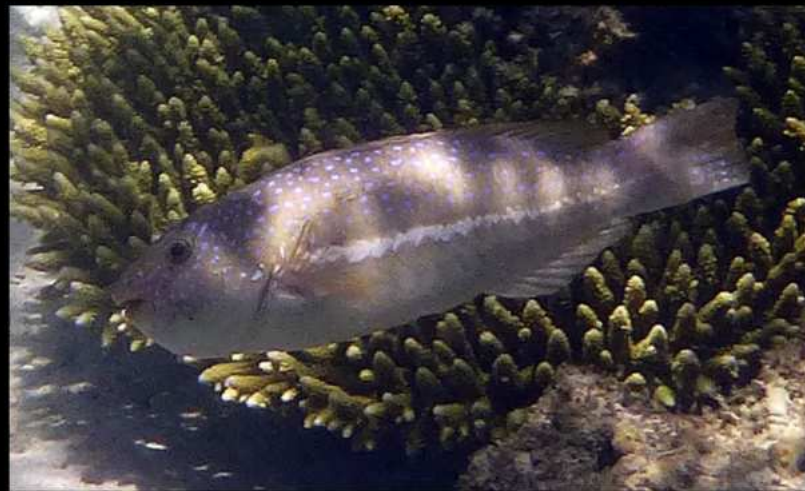
Leptoscarus vaigiensis Seegras-Papageifisch male Seagrass parrotfish Blue spotted parrotfish 2013 Chumbe Island, Zanzibar