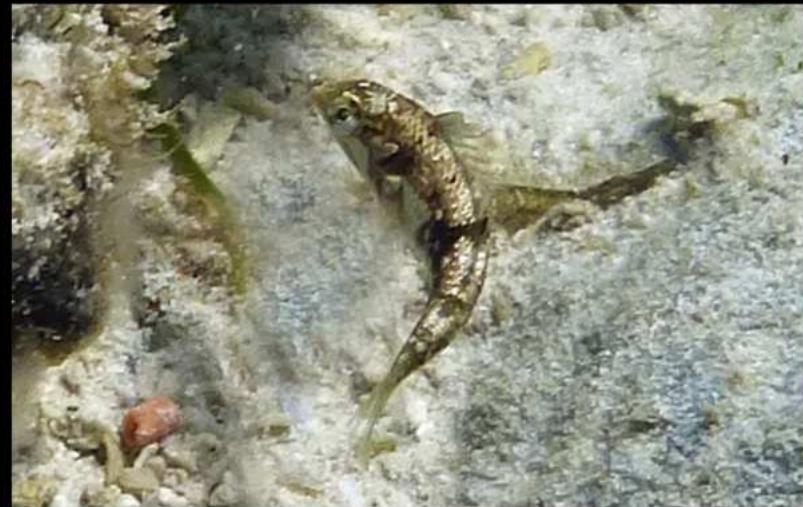
Halichoeres nebulosus Kirschflecken-Lippfisch Nebulosus wrasse juvenile 2015 Chumbe Island, Zanzibar