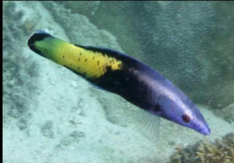
Labroides bicolor Zweifarb-Putzerlippfisch Bicolor cleaner wrasse Chumbe Island, Zanzibar