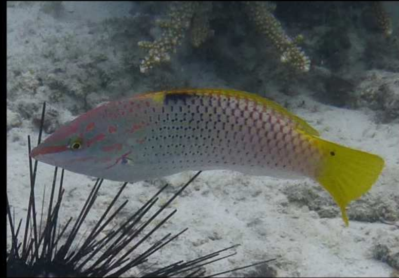
Halichoeres hortulanus Schachbrettjunker female 2016 Chumbe Island, Zanzibar