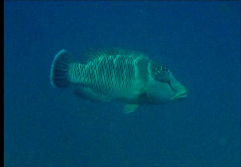
Cheilinus undulatus