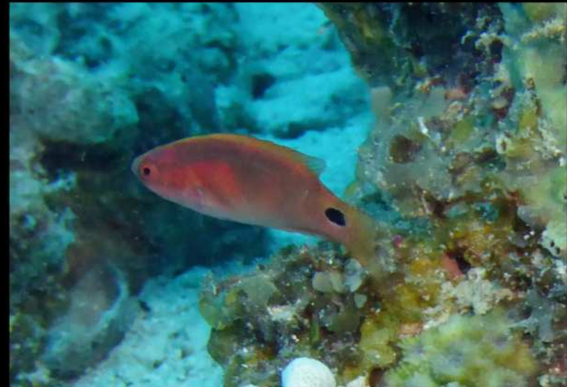
Cirrhilabrus exquisitus Pracht-Zwerglippfisch Exquisite wrasse adult 2023 Mnemba, Zanzibar