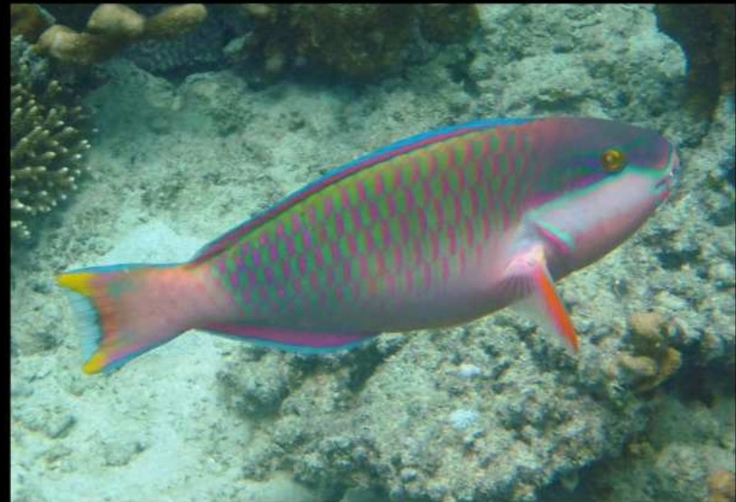
Chlorurus capistratoides Indischer Papageifisch Pale bullethead parrotfish male 2020 Chumbe Island, Zanzibar