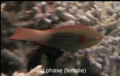
initial phase (female)