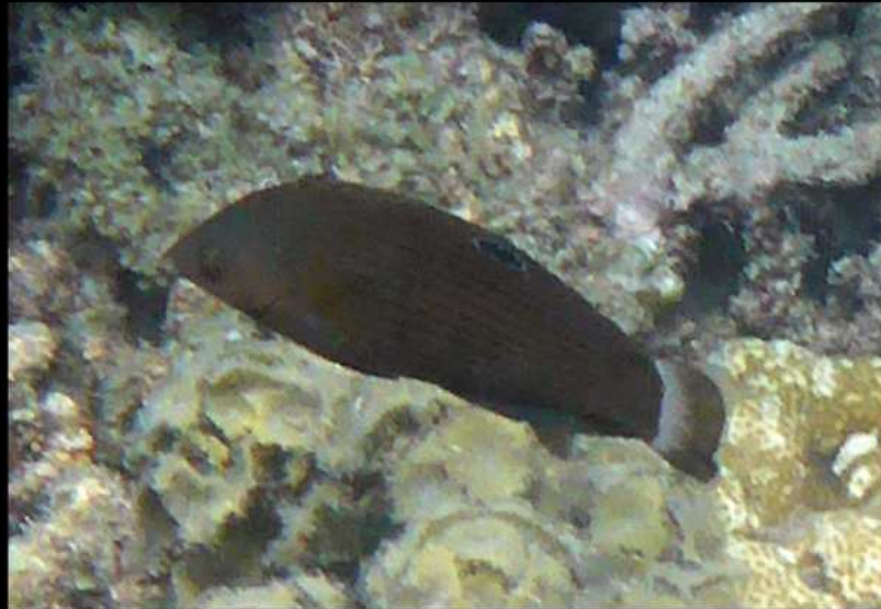
Halichoeres marginatus Prachtregenbogenlippfisch Dusky wrasse female 2017 Chumbe Island, Zanzibar