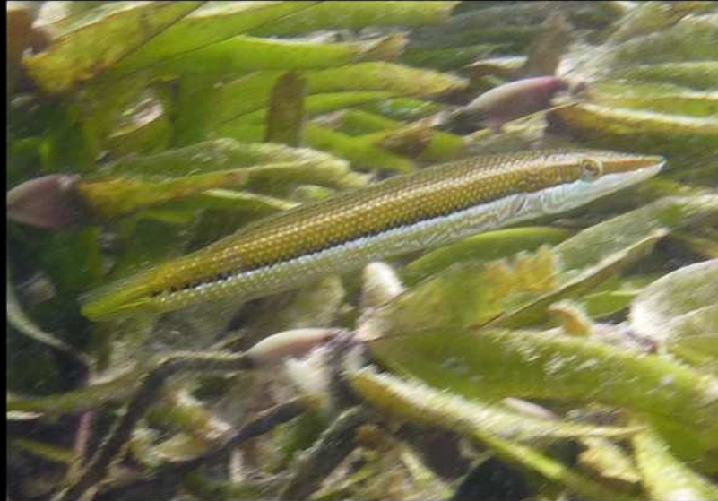
Cheilio inermis