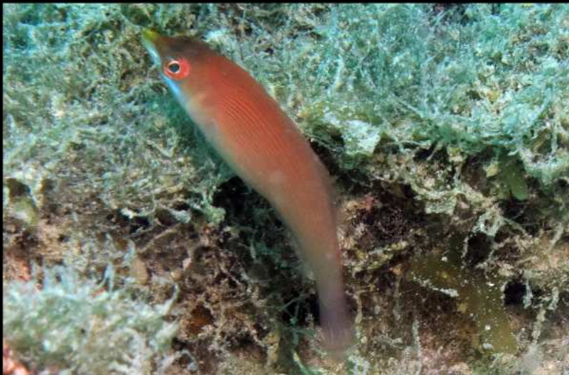
Striated wrasse 2017 Chumbe Island, Zanzibar