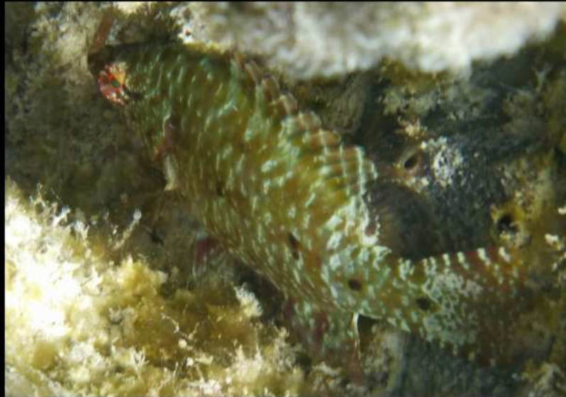
Cheilinus oxycephalus Spitzkopf-Prachtlippfisch Snooty wrasse 2012 Chumbe Island, Zanzibar