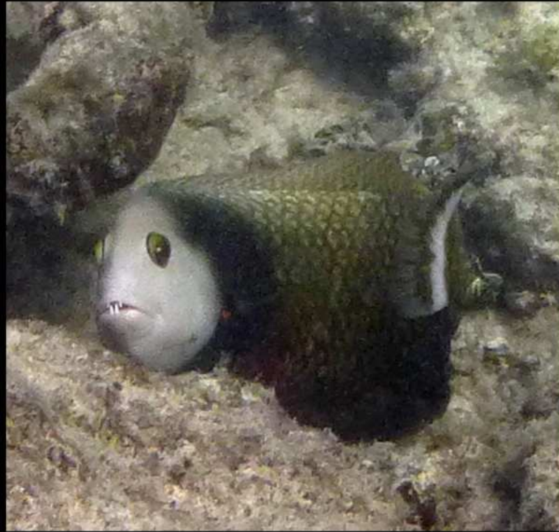
Novaculichthys taeniourus