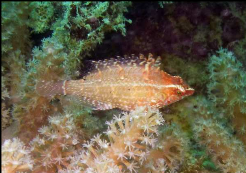
Cryptic wrasse 2017 Chumbe Island, Zanzibar