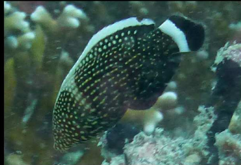
Anampes lineatus