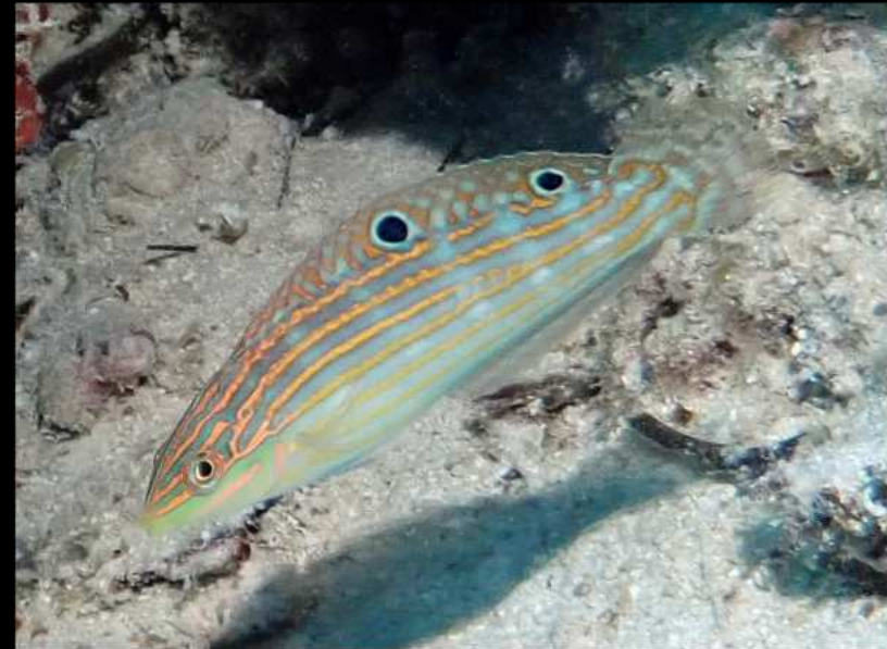
Halichoeres cosmetus