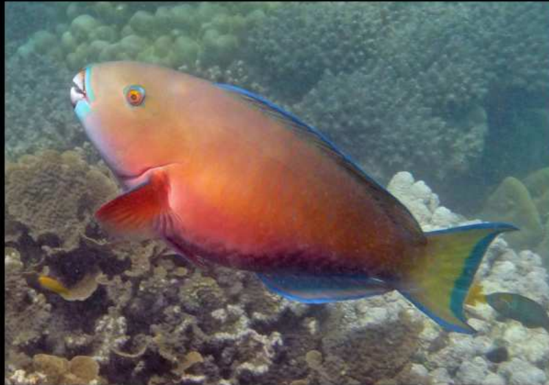
Chlorurus strongylocephalus Indischer Buckelkopf Indian ocean steephead parrotfish Photo: Leyendecker female 2016 Chumbe Island, Zanzibar