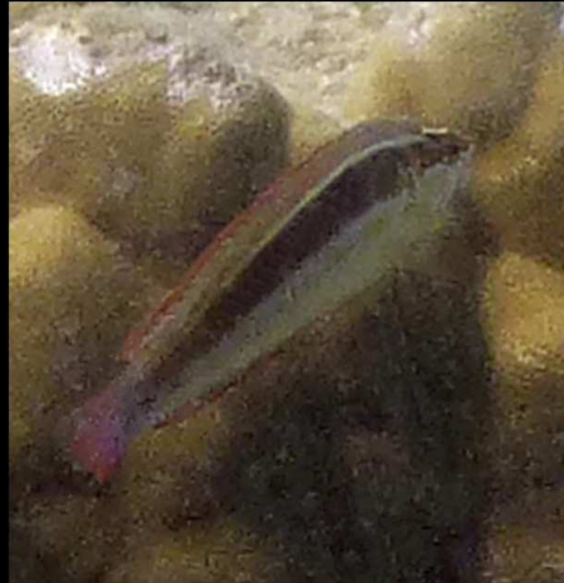
Coris pictoides Zwerg-Junker Blackstripe coris 2014 Chumbe Island, Zanzibar