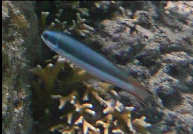
Thalassoma amblycephalum Zweifarb-Lippfisch Bluntheaded wrasse female 2013 Chumbe Island, Zanzibar