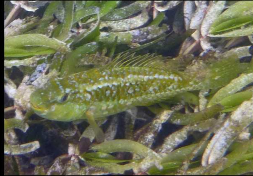
Leptoscarus vaigiensis Seegras-Papageifisch juvenile Seagrass parrotfish Blue spotted parrotfish 2013 Chumbe Island, Zanzibar