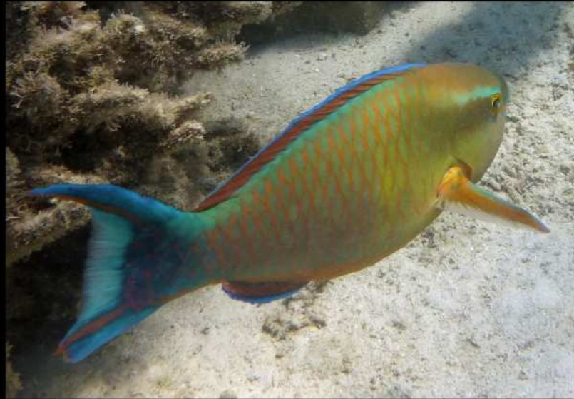
Scarus tricolor Dreifarben-Papageifisch Tricolour parrotfish male 2016 Chumbe Island, Zanzibar