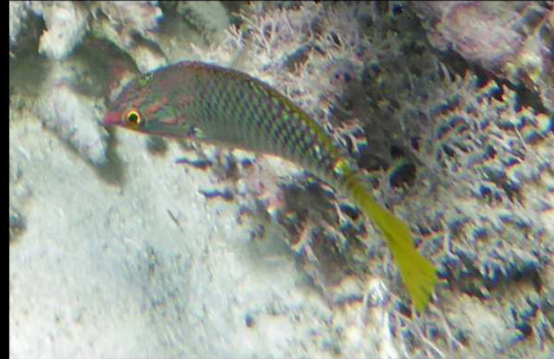
female 2016 Chumbe Island, Zanzibar