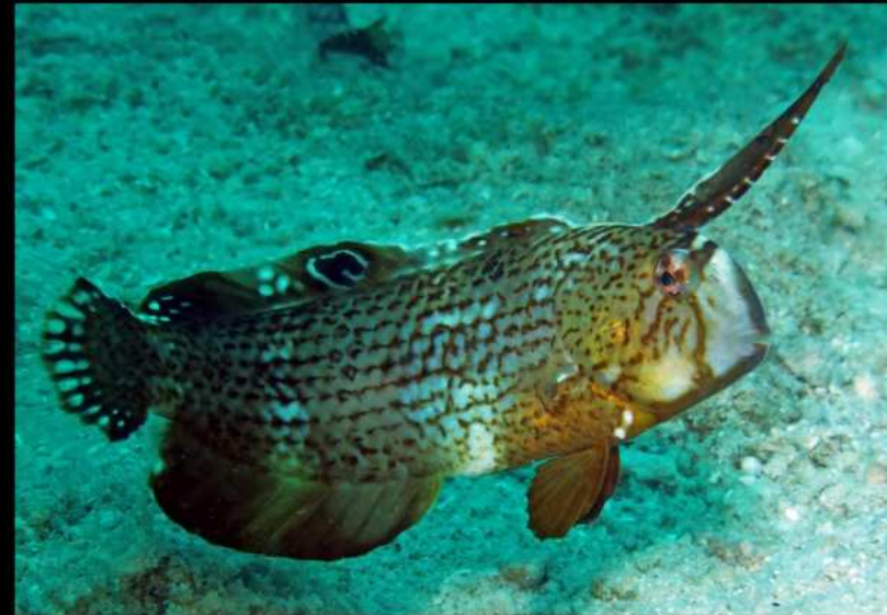
Iniistius pavo