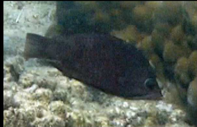
female colour variant