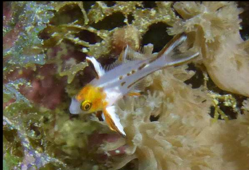
14 Bodianus anthioides Zweifarben-Schweinslippfisch Lyretail hogfish Mnemba, Zanzibar