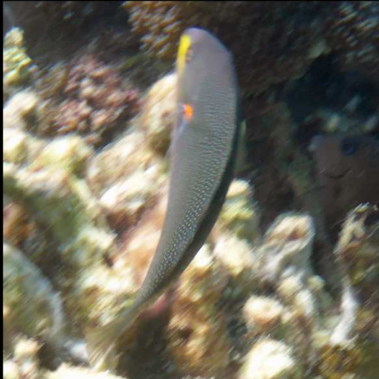
Stethojulis bandanensis