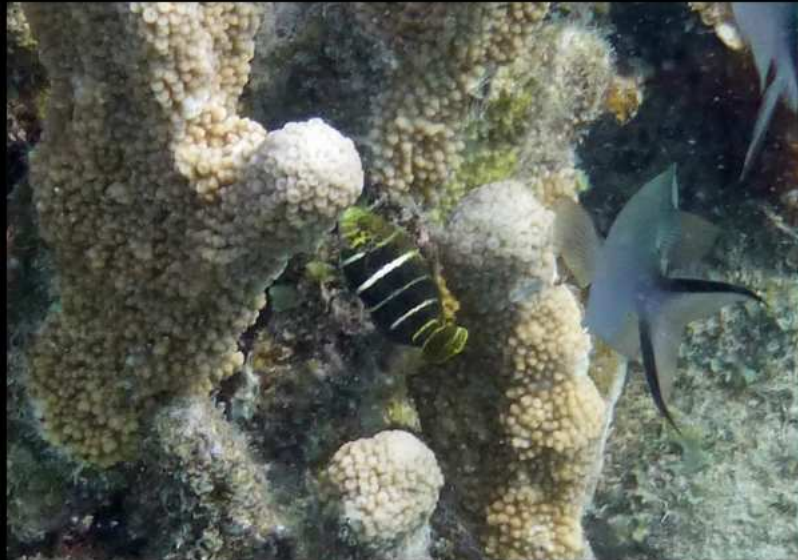
Hemigymnus fasciatus Streifenbanner-Lippfisch juvenile Barred thicklip wrasse or Blackedge wrasse Photos: Leyendecker 2016 Chumbe Island, Zanzibar