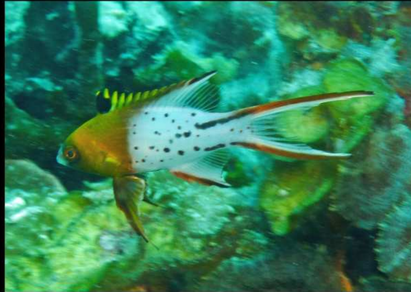
Bodianus anthioides Zweifarben-Schweinslippfisch Lyretail hogfish Chumbe Island, Zanzibar