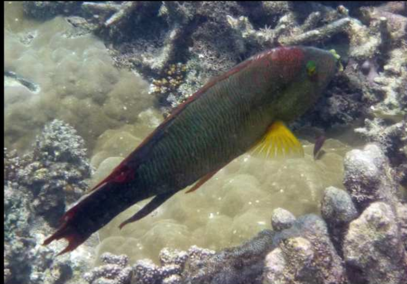
Cheilinus trilobatus