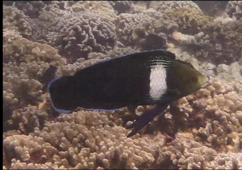
Labrichthys unilineatus Fransen-Putzerfisch adult male 2012 Chumbe Island, Zanzibar Tubelip wrasse