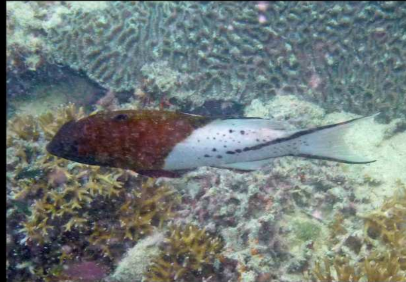
Bodianus anthioides Zweifarben-Schweinslippfisch Lyretail hogfish Photo: Martin Leyendecker 2018 Chumbe Island, Zanzibar