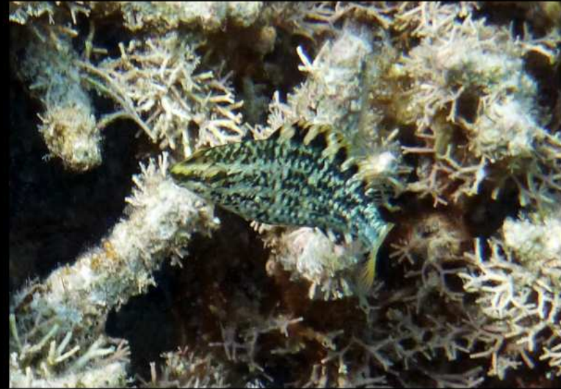
Scarus falcipinnis Papageifisch juvenile Sicklefim parrotfish Photos: Martin Leyendecker 2016 Chumbe Island, Zanzibar