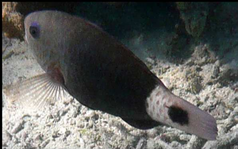
Chlorurus sordidus Kugelkopf-Papageifisch Bullethead parrotfish Daisy parrotfish (female) 2010 Chumbe Island, Zanzibar