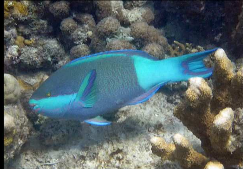
Scarus frenatus