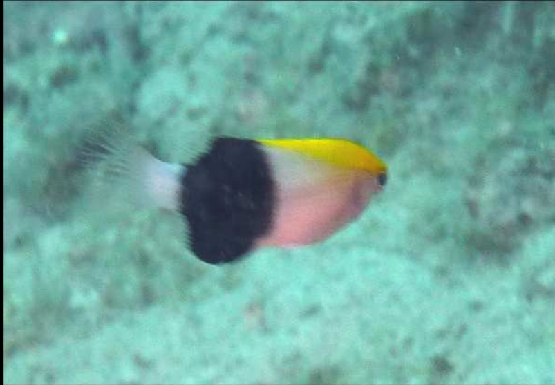
Bodianus bilunulatus