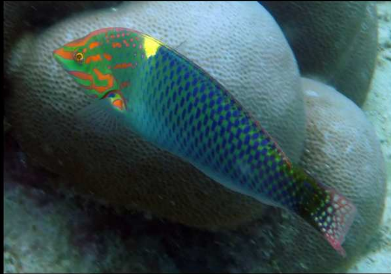
Halichoeres hortulanus Schachbrettjunker male Photo: Dr. H.-W. Leyendecker 2020 Chumbe Island, Zanzibar