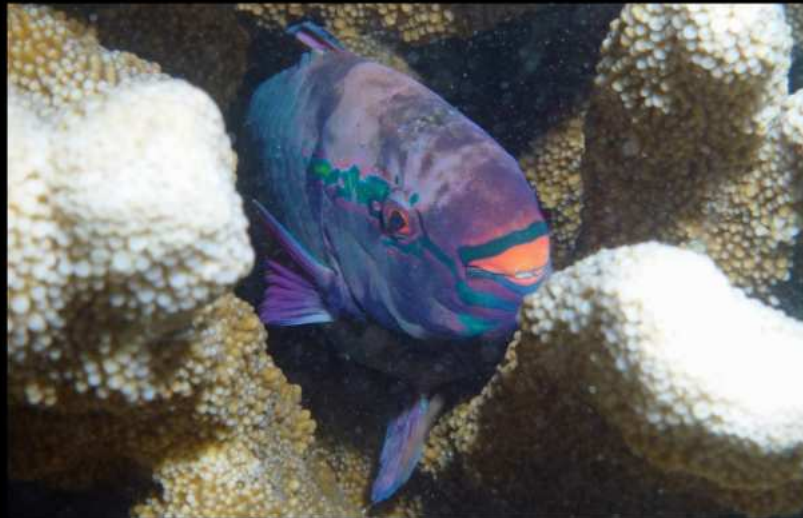
Scarus niger