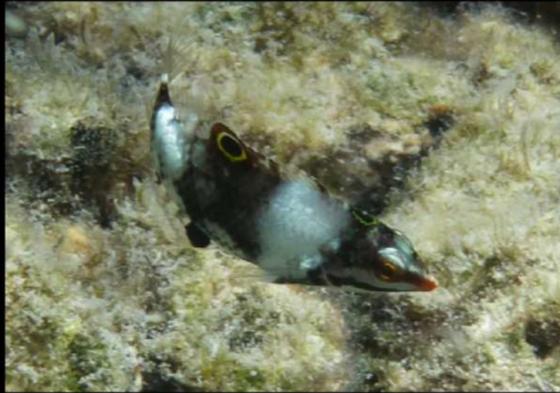
Halichoeres hortulanus