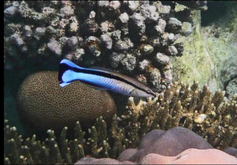
Labroides dimidiatus Gewöhnlicher Putzerlippfisch Bluestreak cleaner wrasse 2009 Chumbe Island, Zansibar