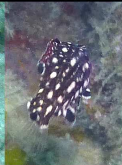
Chumbe Island, Zanzibar