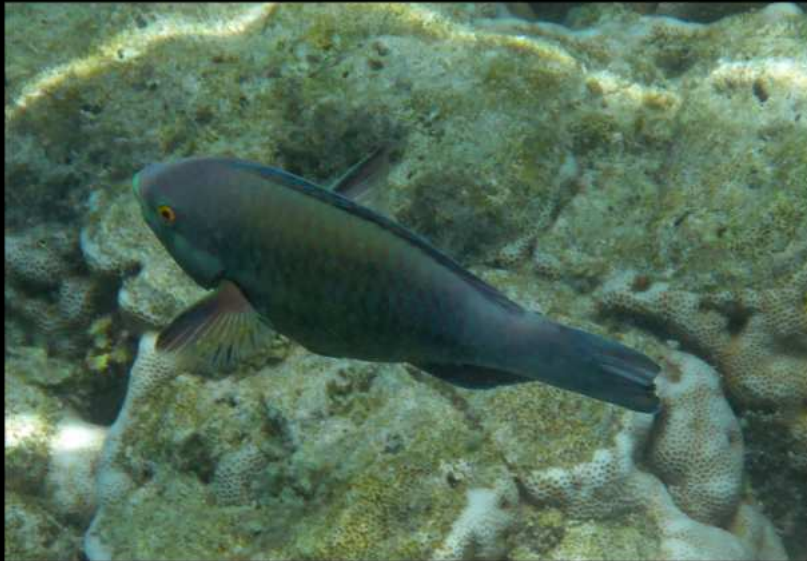
Scarus viridifucatus