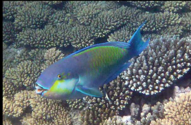
Chlorurus bleekeri Bleekers Papageifisch Bleeker's parrotfish male 2022 Chumbe Island, Zanzibar