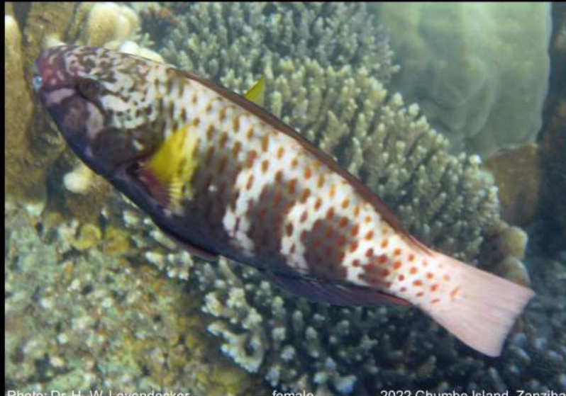
female 2022 Chumbe Island, Zanzibar