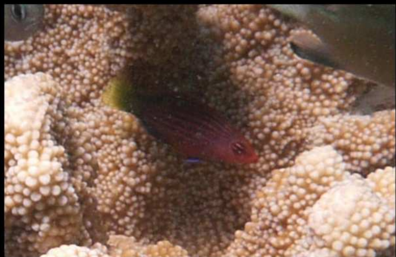
Sixline wrasse 2015 Chumbe Island, Zanzibar