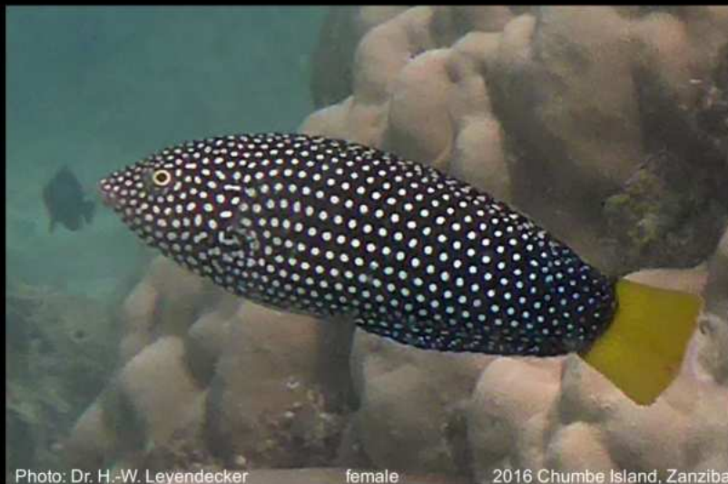
female 2016 Chumbe Island, Zanzibar