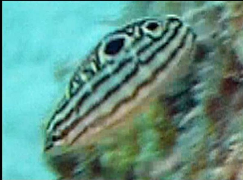
Halichoeres cosmetus