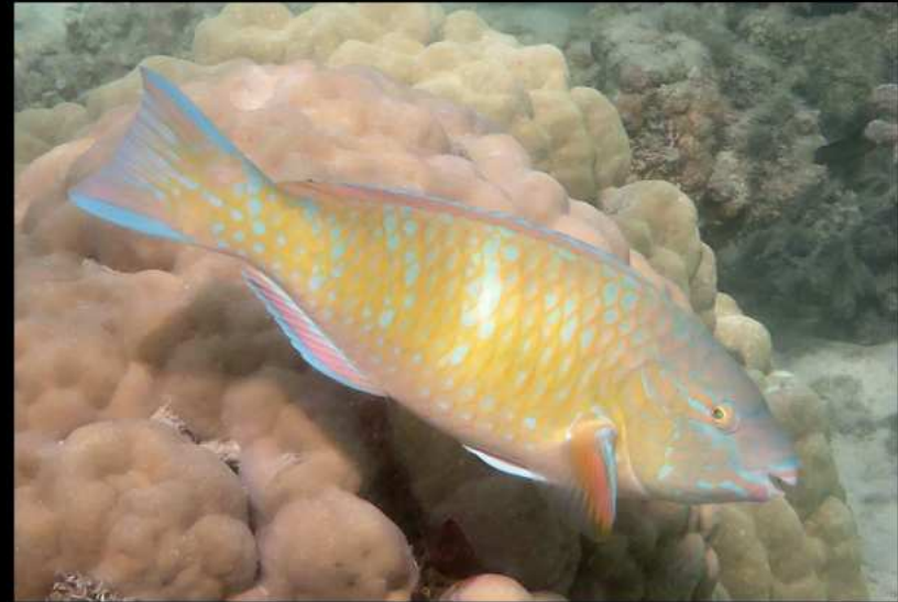
Scarus ghobban Blauband-Papageifisch Blue-barred parrotfish female 2016 Chumbe Island, Zanzibar