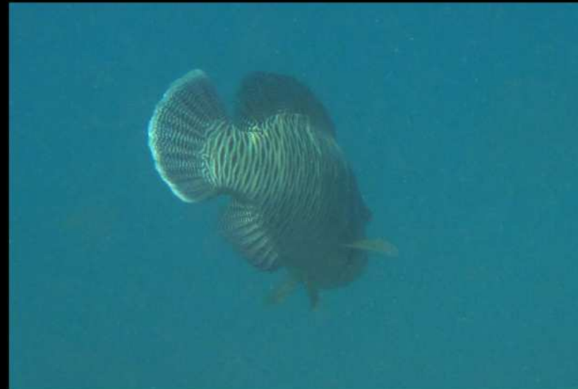
Humphead wrasse 2018 Chumbe Island, Zanzibar