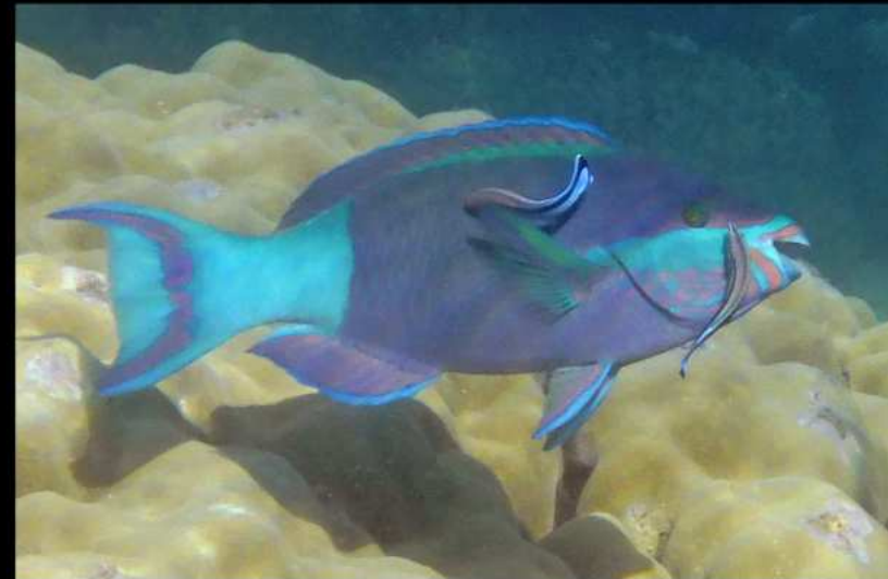
Bridled parrotfish 2022 Chumbe Island, Zanzibar