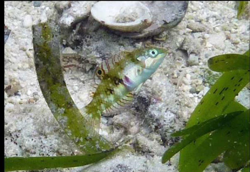
Halichoeres nebulosus Kirschflecken-Lippfisch Nebulosus wrasse 2015 Chumbe Island, Zanzibar