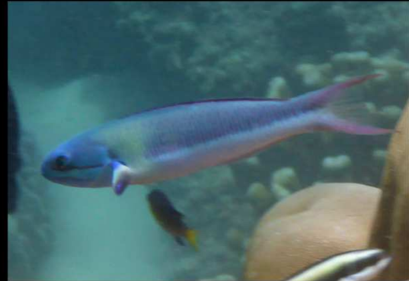
Thalassoma amblycephalum Zweifarb-Lippfisch Bluntheaded wrasse adult male 2019 Chumbe Island, Zanzibar