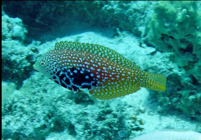
Macropharyngodon bipartitus