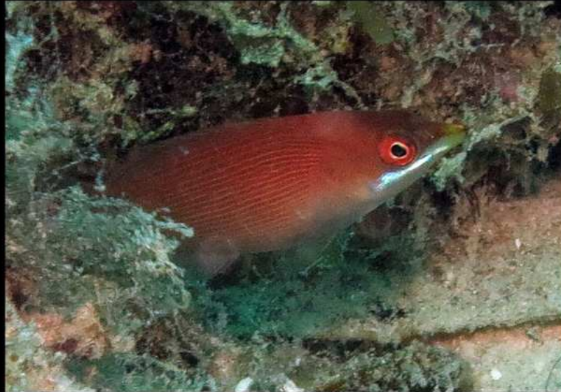
Pseudocheilinus evandidus