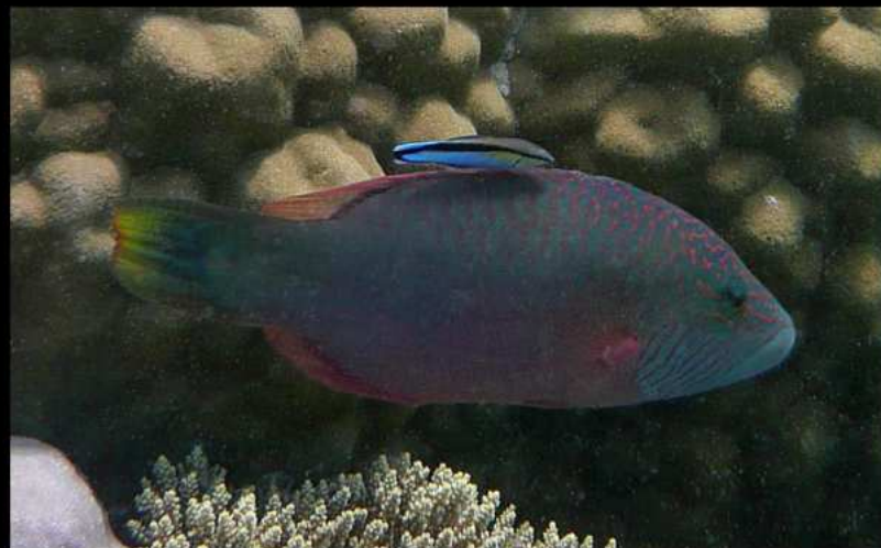
adult 2016 Chumbe Island, Zanzibar