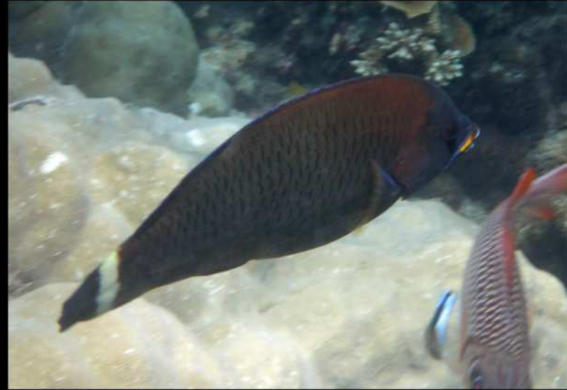
Pseudodax moluccanus