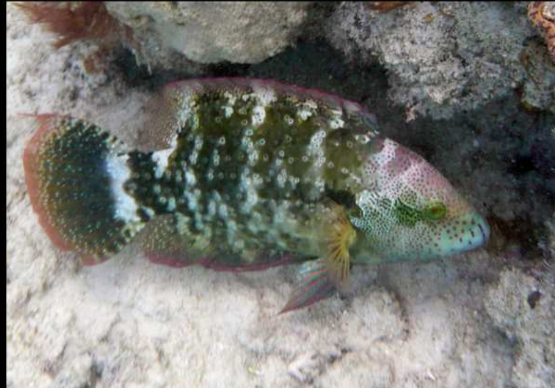
Cheilinus chlorourus Schneeflocken-Prachtlippfisch Floral splendour wrasse Chumbe Island, Zanzibar