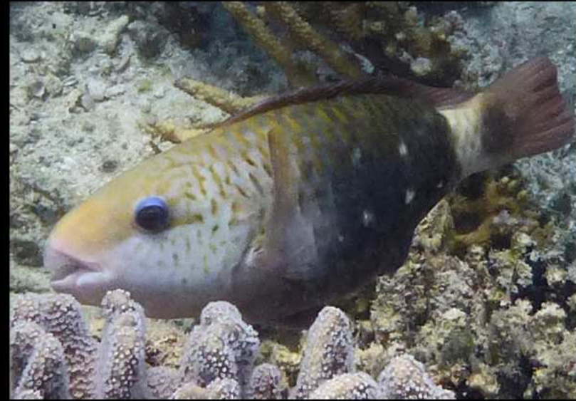
Chlorurus sordidus Kugelkopf-Papageifisch (initial phase) Daisy parrotfish Bullethead parrotfish 2012 Chumbe Island, Zanzibar