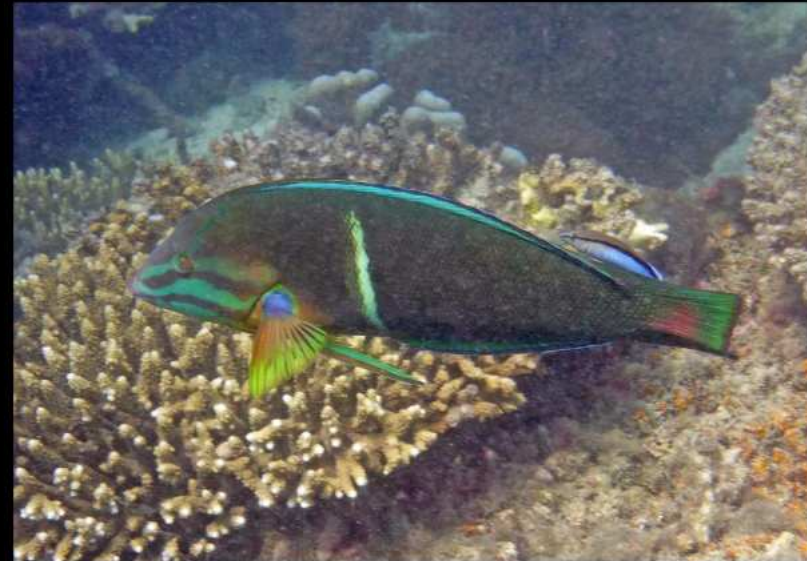
Coris cuvieri