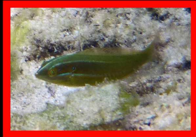
Unidentified wrasse