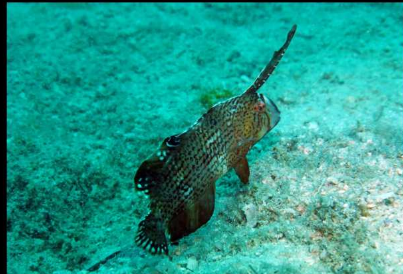
Blue razorfish 2017 Chumbe Island, Zanzibar