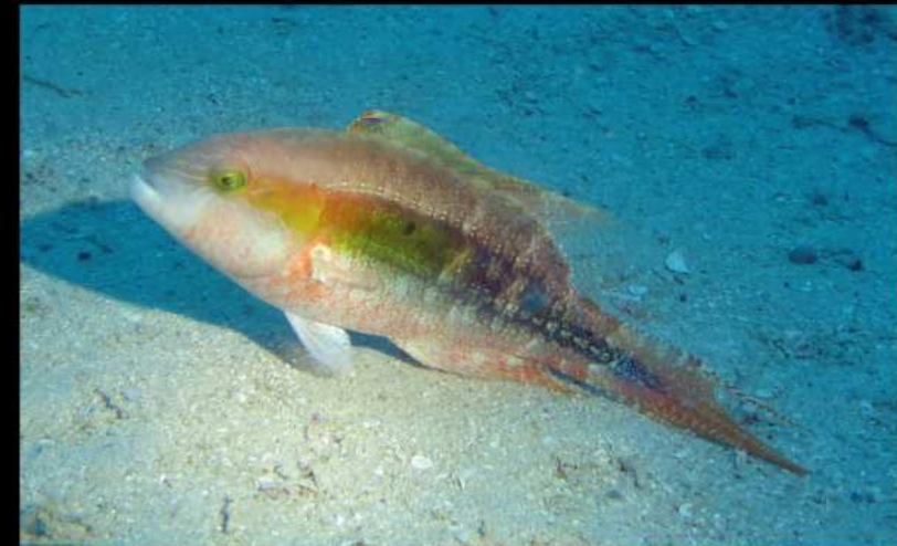
Oxycheilinus bimaculatus