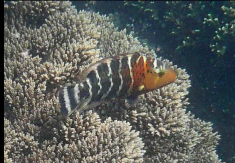
Cheilinus fasciatus Rotbrust-Prachtlippfisch Redbreasted splendour wrasse 2009 Chumbe Island, Zanzibar