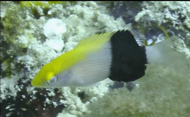
Bodianus bilunulatus