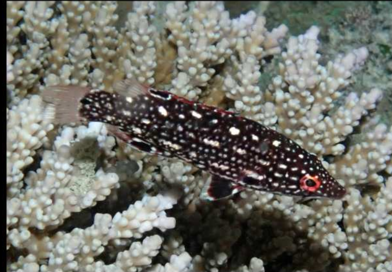
Bodianus diana Dianas Schweinslippfisch Diana's hogfish juvenile 2023 Chumbe Island, Zanzibar