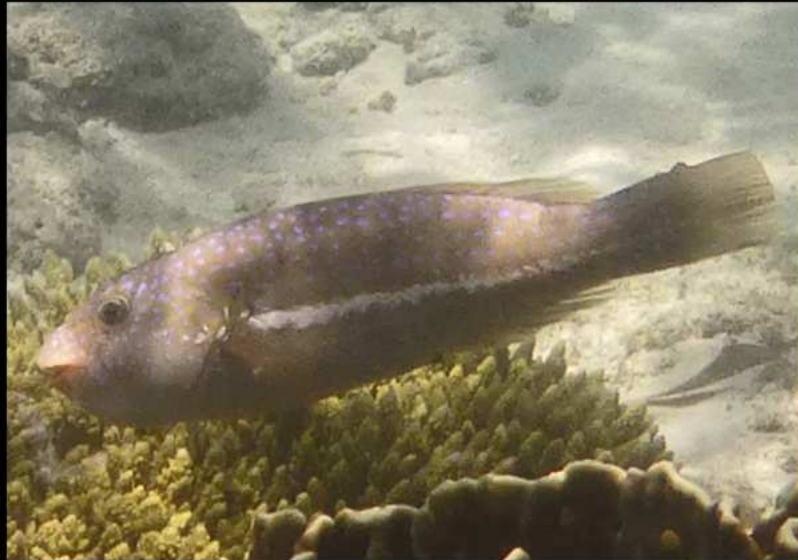
Leptoscarus vaigiensis Seegras-Papageifisch male Seagrass parrotfish Blue spotted parrotfish 2013 Chumbe Island, Zanzibar