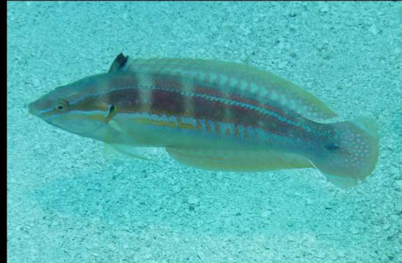
Coris caudimaculata