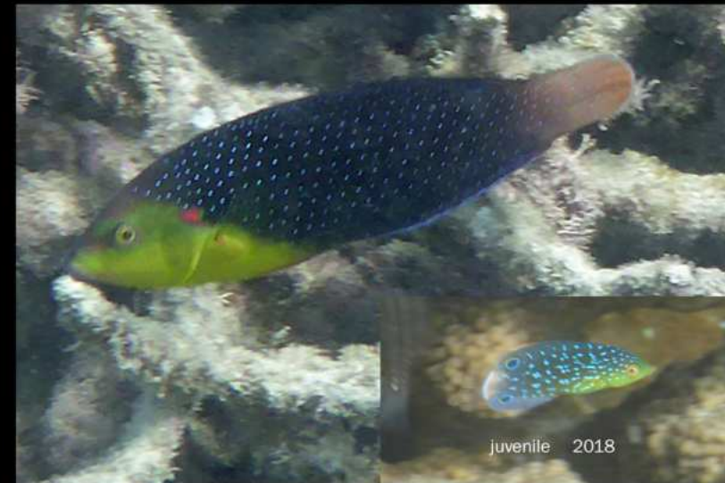
juvenile 2018 2016 Chumbe Island, Zanzibar