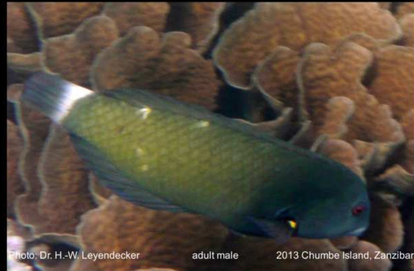
Photo: Dr. H.-W. Leyendecker adult male 2013 Chumbe Island, Zanzibar