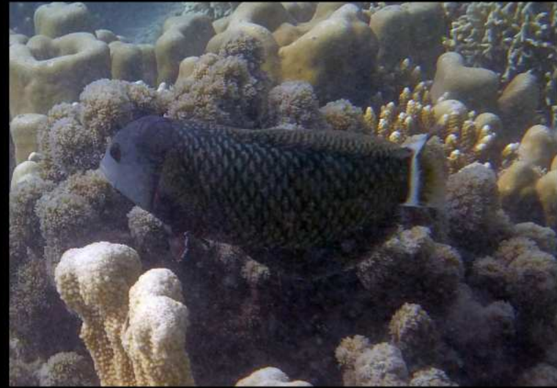
Novaculichthys taeniourus Bäumchen-Lippfisch Rockmover wrasse adult female 2011 Chumbe Island, Zanzibar