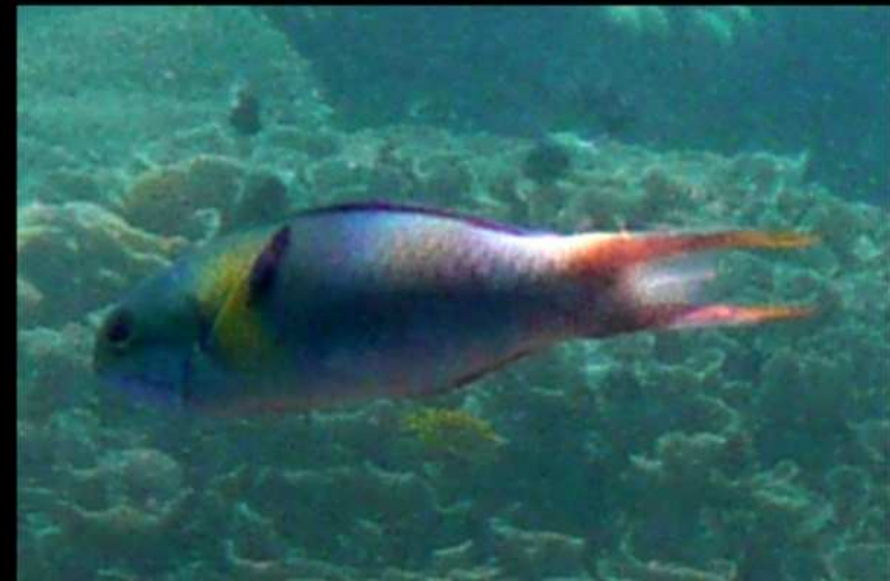
adult 2012 Chumbe Island, Zanzibar