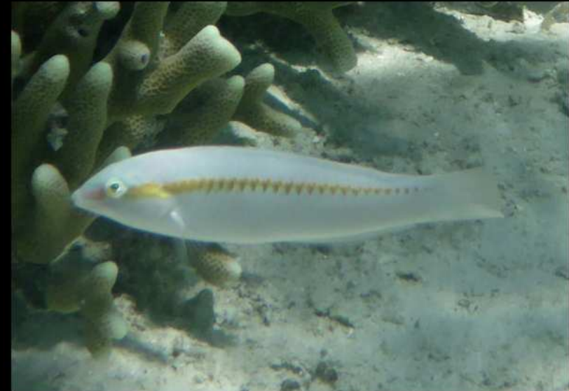
Halichoeres zeylonicus