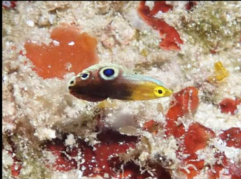
Halichoeres iridis