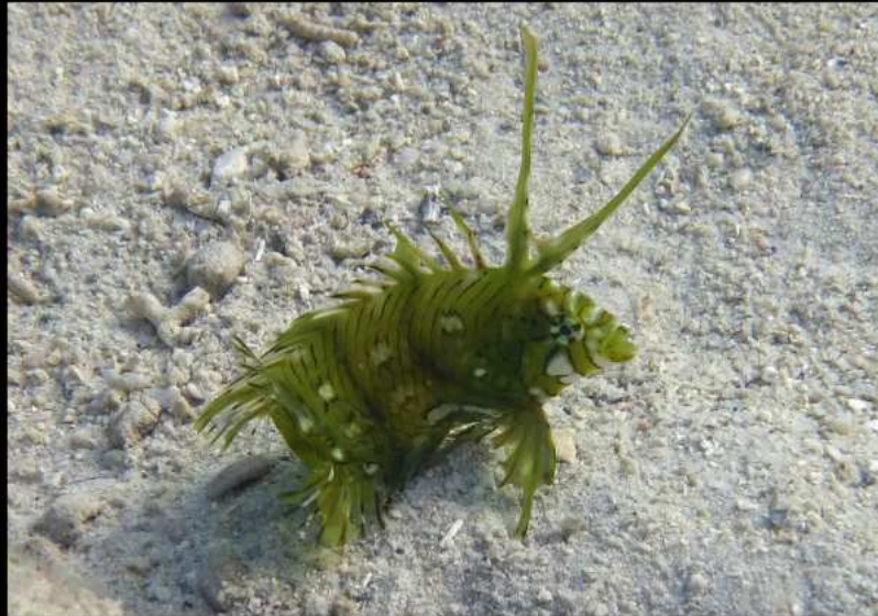
Novaculichthys taeniourus Bäumchen-Lippfisch Rockmover wrasse juvenile 2015 Chumbe Island, Zanzibar