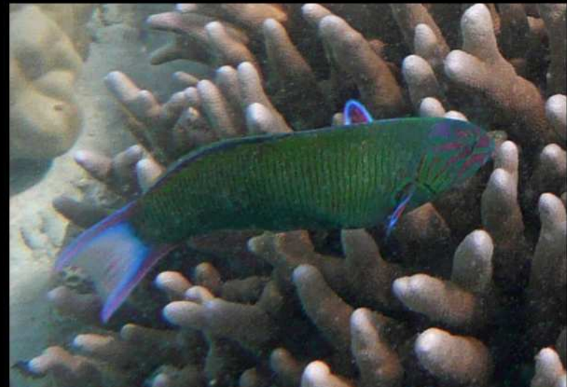
Thalassoma lunare Mondsichel-Junker Moon wrasse or Crescent wrasse male 2009 Chumbe Island, Zansibar