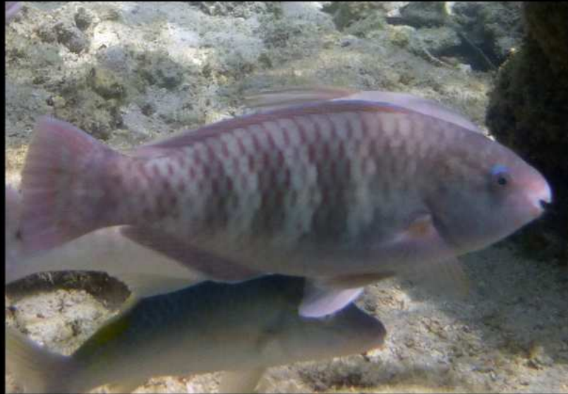
Scarus schlegelii Papageifisch female Yellowband parrotfish 2013 Chumbe Island, Zanzibar