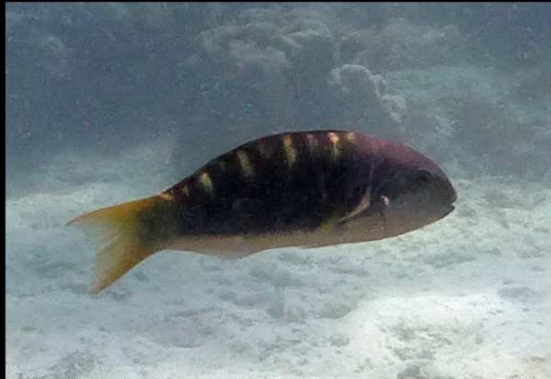
Thalassoma janseni Jansens Junker Jansen's wrasse 2014 Chumbe Island, Zansibar