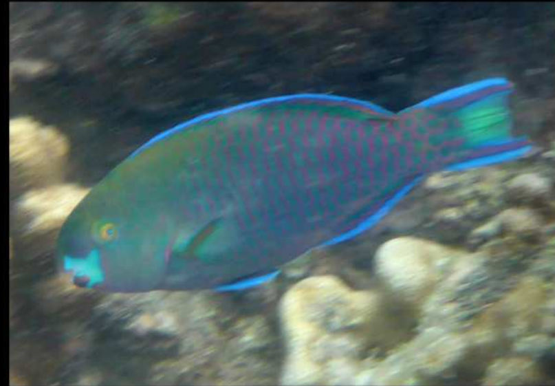
Scarus viridifucatus