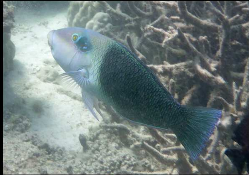
Hemigymnus melapterus