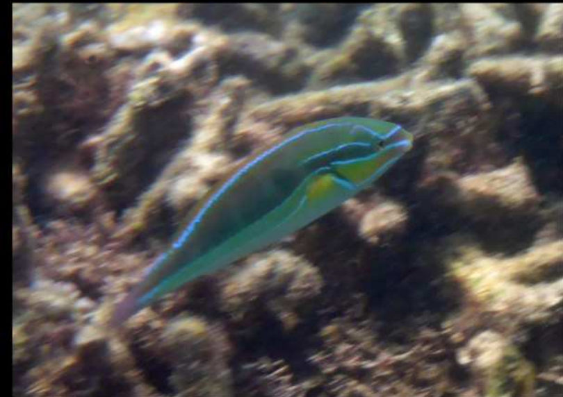
Red shoulder wrasse 2019 Chumbe Island, Zanzibar