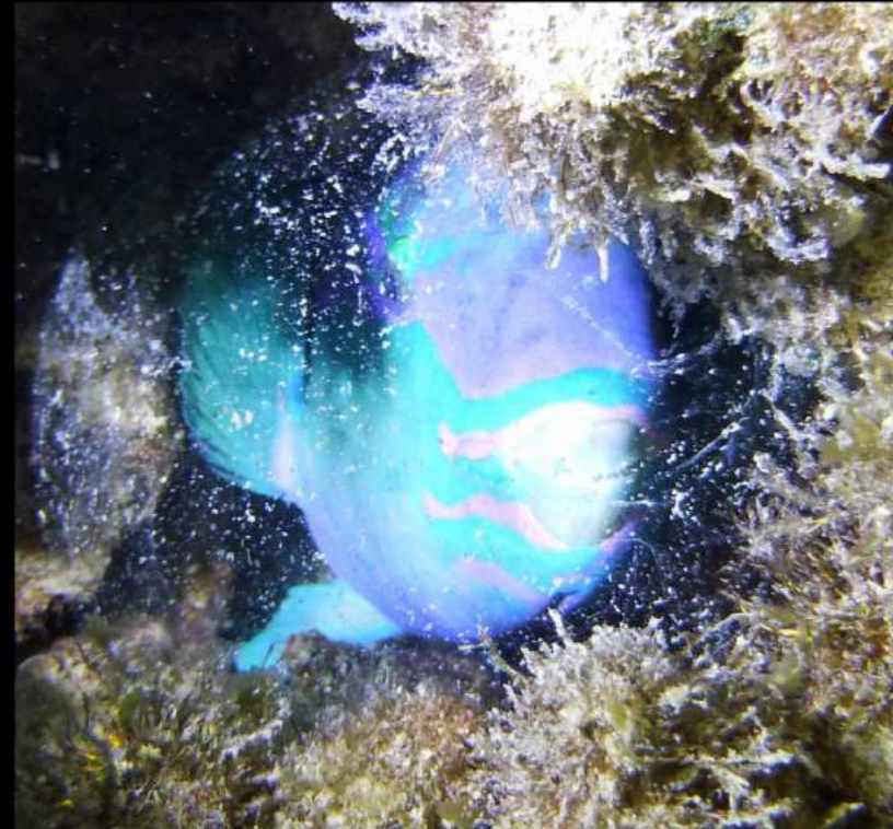
At night: Sleeping male Chlorurus sordidus in a bubble 2015 Chumbe Island, Zanzibar