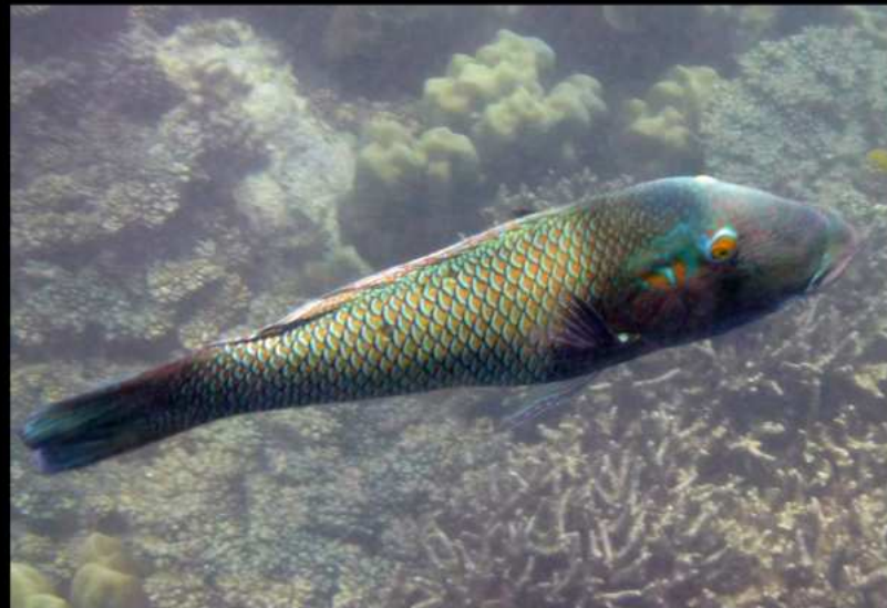
Hemigymnus melapterus