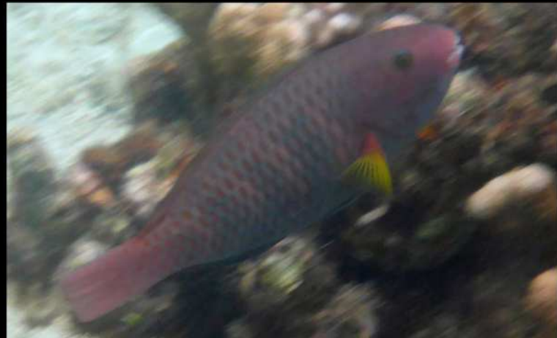
Scarus ferrugineus Papageifisch female Rusty parrotfish Photos: H.-W. Leyendecker 2019 Chumbe Island, Zanzibar