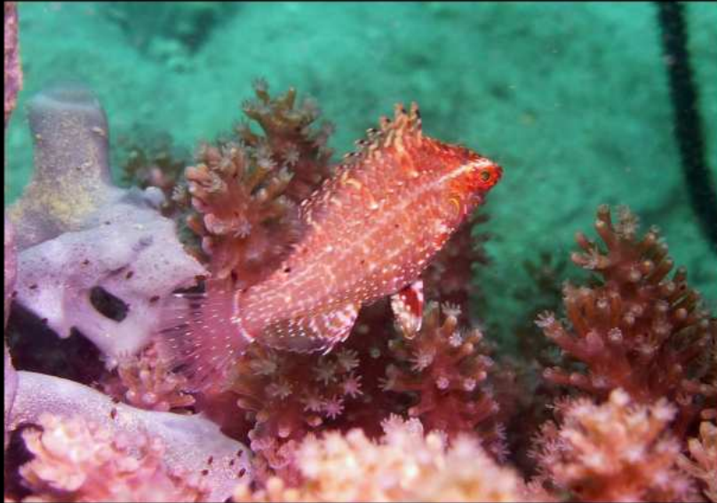
Pteragogus cryptus