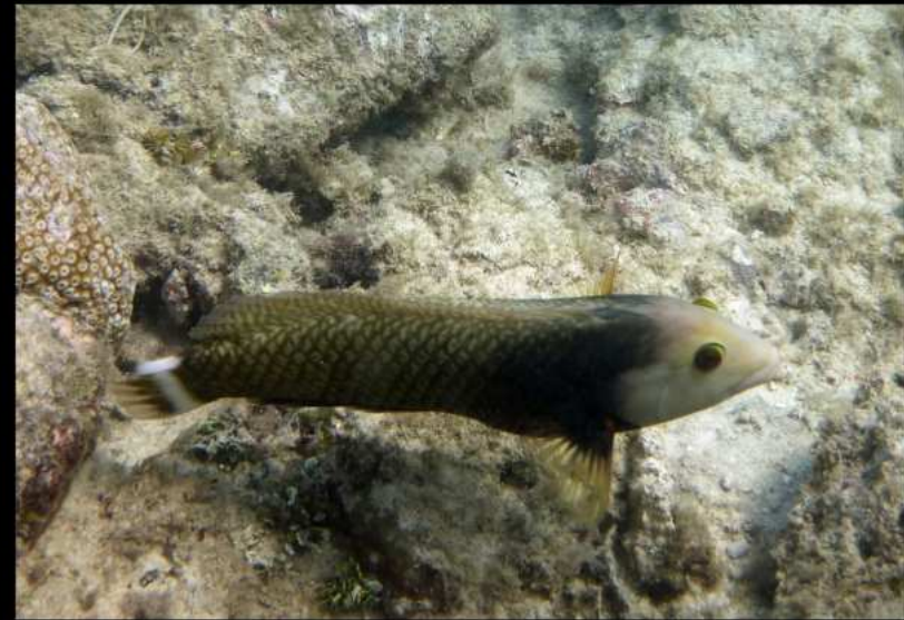
Novaculichthys taeniourus