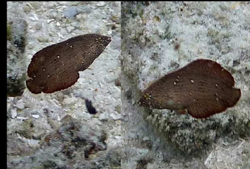
Anampes caeruleopunctatus