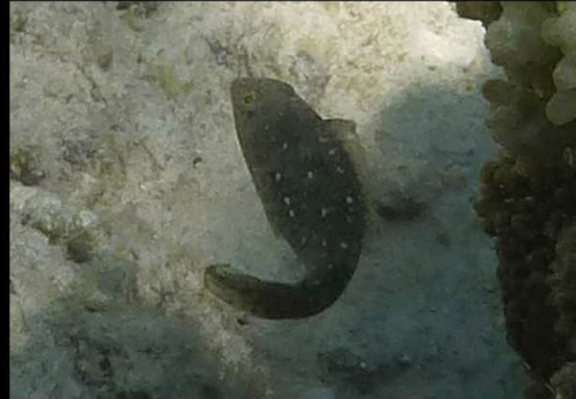
Sparisoma rubripinne Gelbschwanz-Papageifisch Redfin parrotfish juvenile 2013 Chumbe Island, Zanzibar