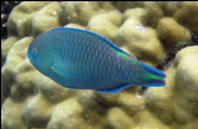
Scarus viridifucatus