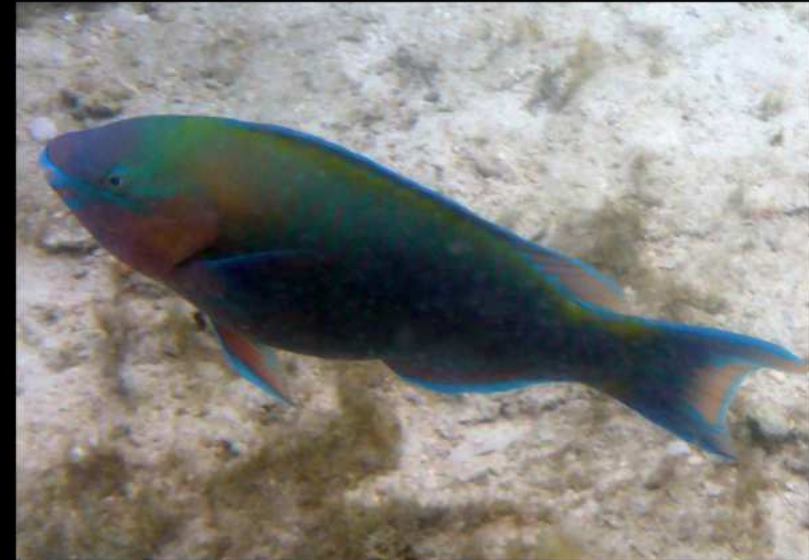
Scarus psittacus