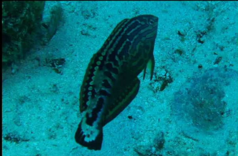
Macropharyngodon bipartitus