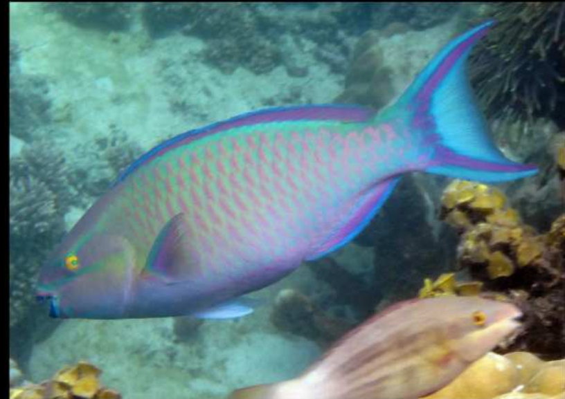
Scarus tricolor