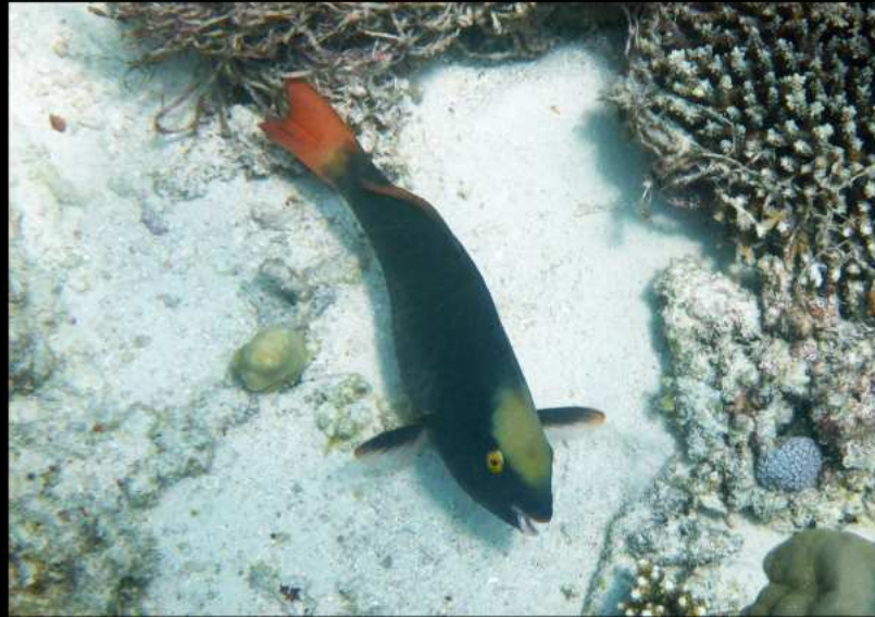
Scarus tricolor