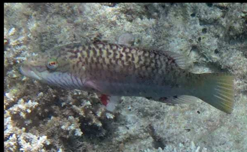
female 2020 Chumbe Island, Zanzibar