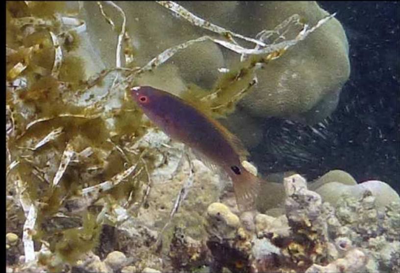
Cirrhilabrus exquisitus Pracht-Zwerglippfisch Exquisite wrasse juvenile 2015 Chumbe Island, Zanzibar