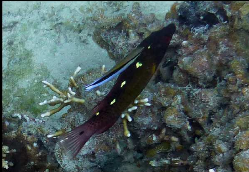
20 Photo: Leyendecker 2015 Chumbe Island, Zanzibar