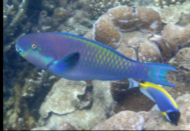
Chlorurus strongylocephalus Indischer Buckelkopf Indian ocean steephead parrotfish male 2022 Chumbe Island, Zanzibar