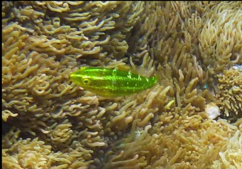
Scarus frenatus