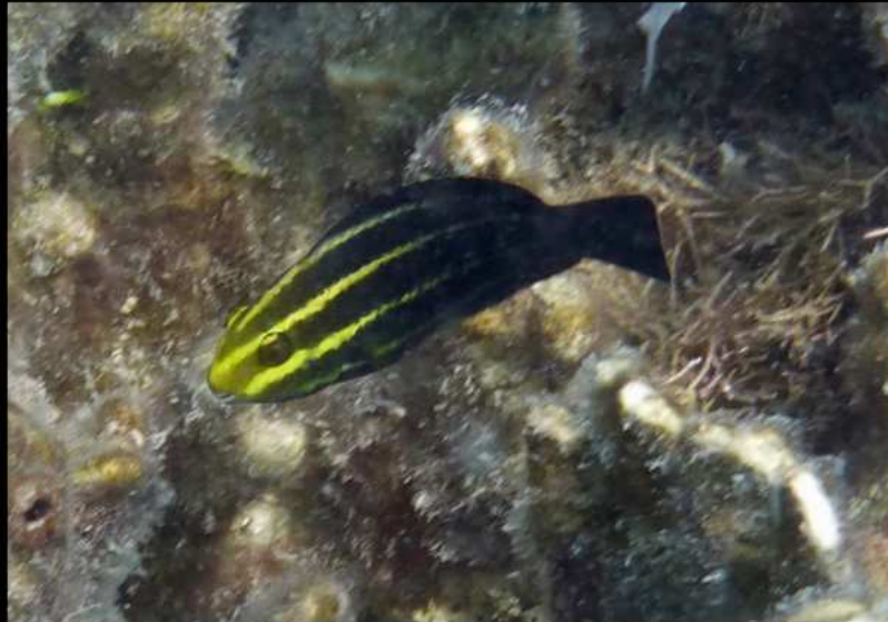
Chlorurus strongylocephalus Indian ocean steephead parrotfish (juvenile) Indischer Buckelkopf 2016 Chumbe Island, Zanzibar