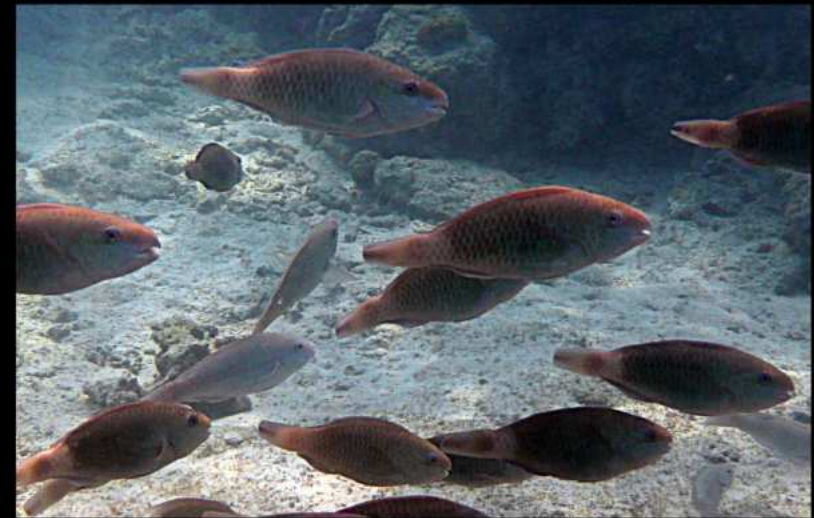
Scarus rubroviolaceus juvenile Schule mit Jungfischen Ember parrotfish (school) 2007 Chumbe Island, Zanzibar