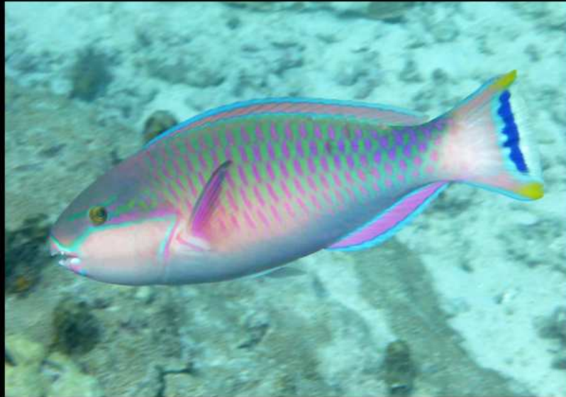
Chlorurus atrilunula Papageifisch Black crescent parrotfish male 2019 Chumbe Island, Zanzibar