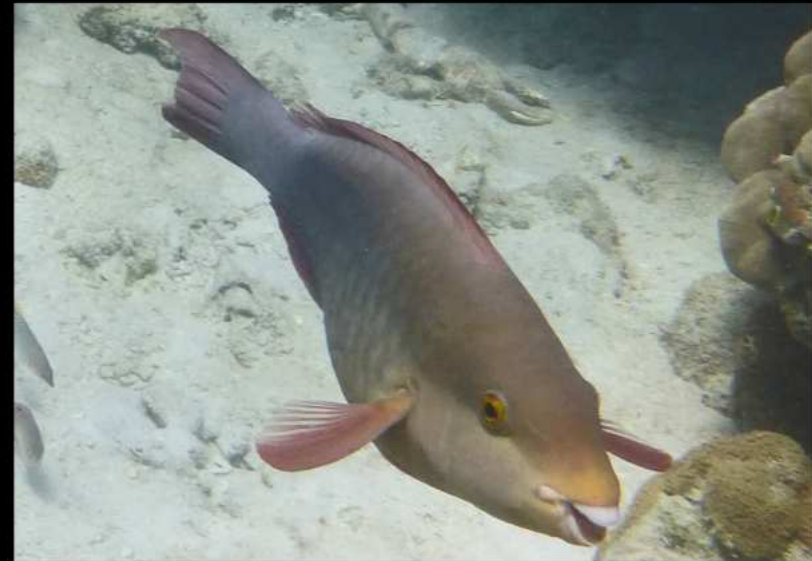
Scarus frenatus