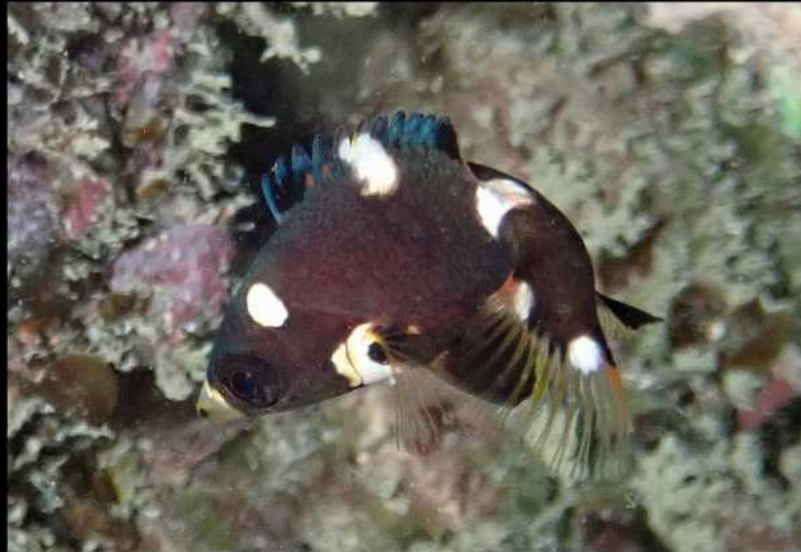
Bodianus axillaris Achselfleck-Schweinslippfisch Axilspot Hogfish juvenile 2023 Chumbe Island, Zanzibar