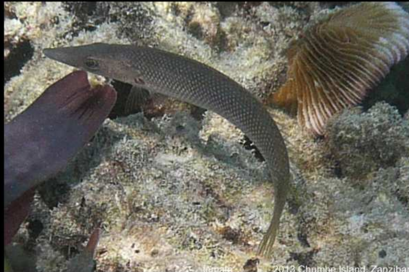
Cheilio inermis male 2013 Chumbe Island, Zanzibar