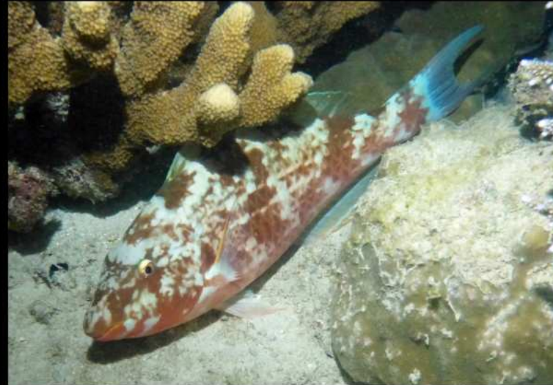
Hipposcarus harid