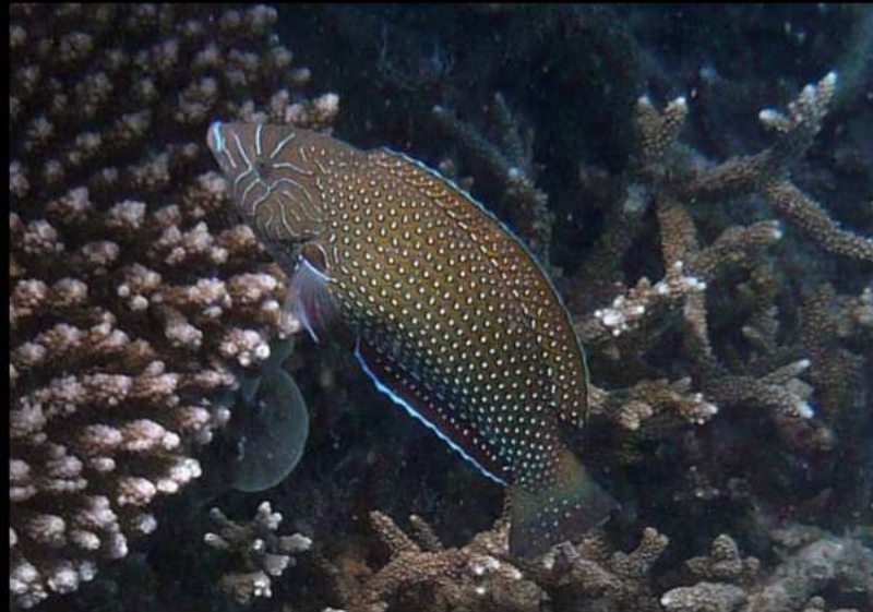
Anampes caeruleopunctatus