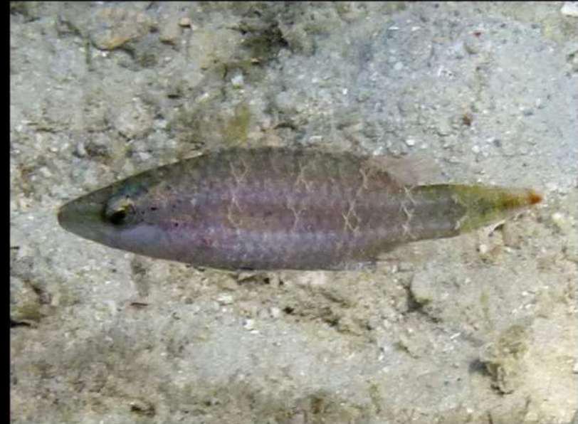
Oxycheilinus orientalis Photo: Leyendecker