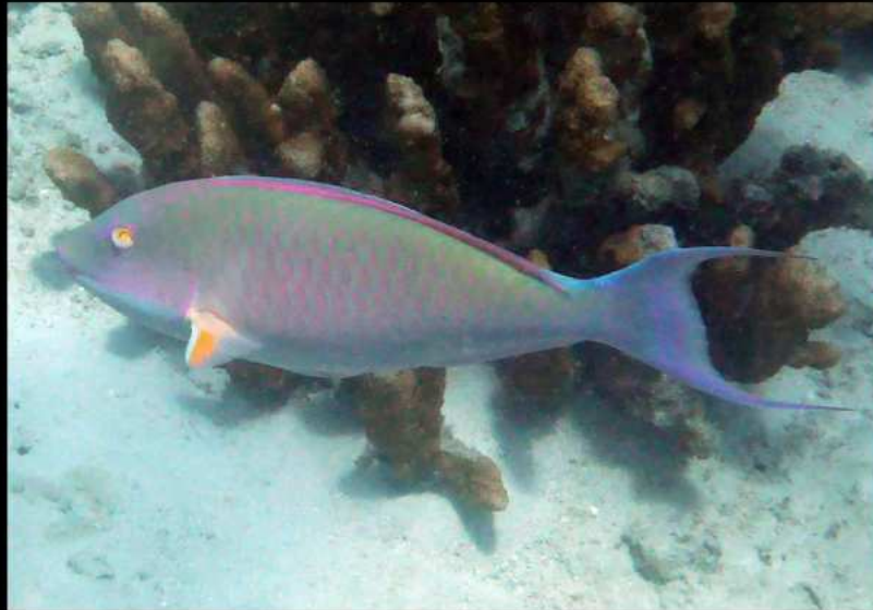
Hipposcarus harid