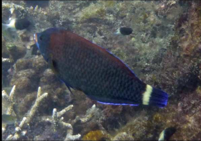
Pseudodax moluccanus