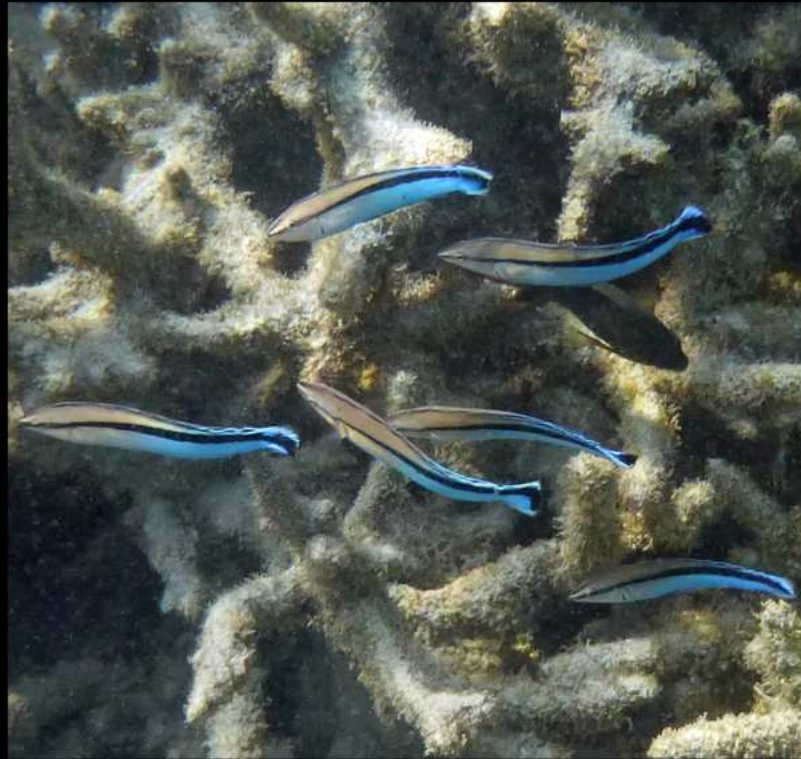
Labroides dimidiatus Gewöhnlicher Putzerlippfisch Bluestreak cleaner wrasse Chumbe Island, Zansibar