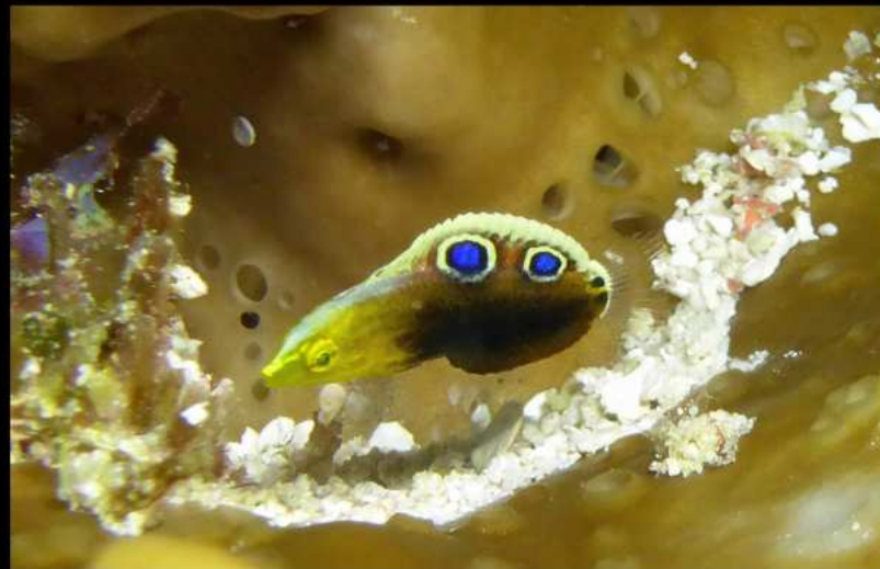
Halichoeres iridis