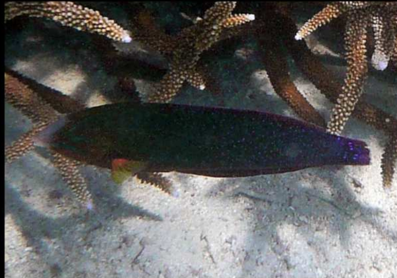
Coris cuvieri