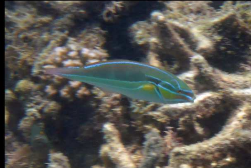
Stethojulis bandanensis