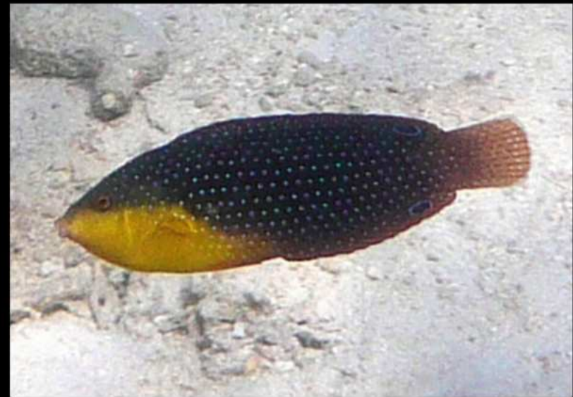
Anampses twistii Twists Junker Twist's wrasse 2013 Chumbe Island, Zanzibar