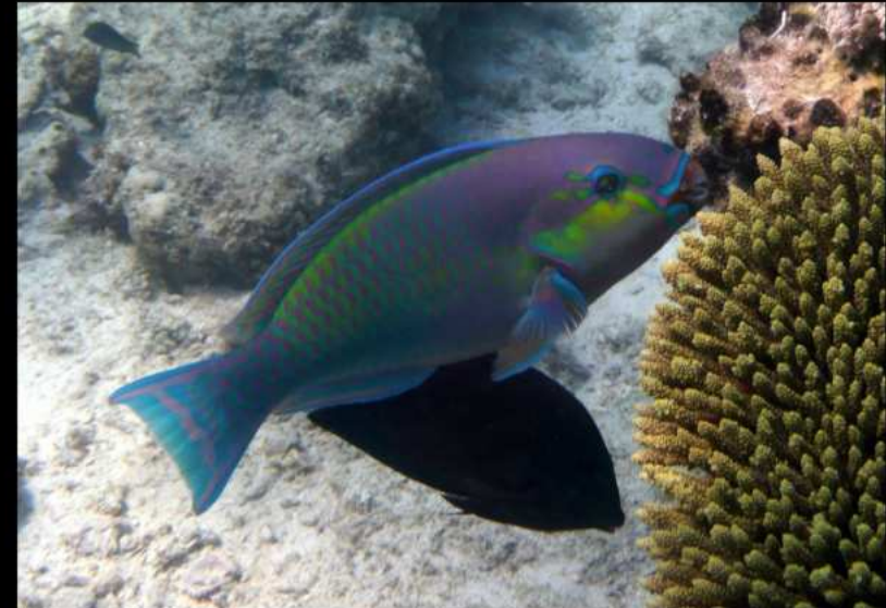
Scarus rubroviolaceus Nasenhöcker-Papageifisch male Ember or Redlip parrotfish 2007 Chumbe Island, Zanzibar