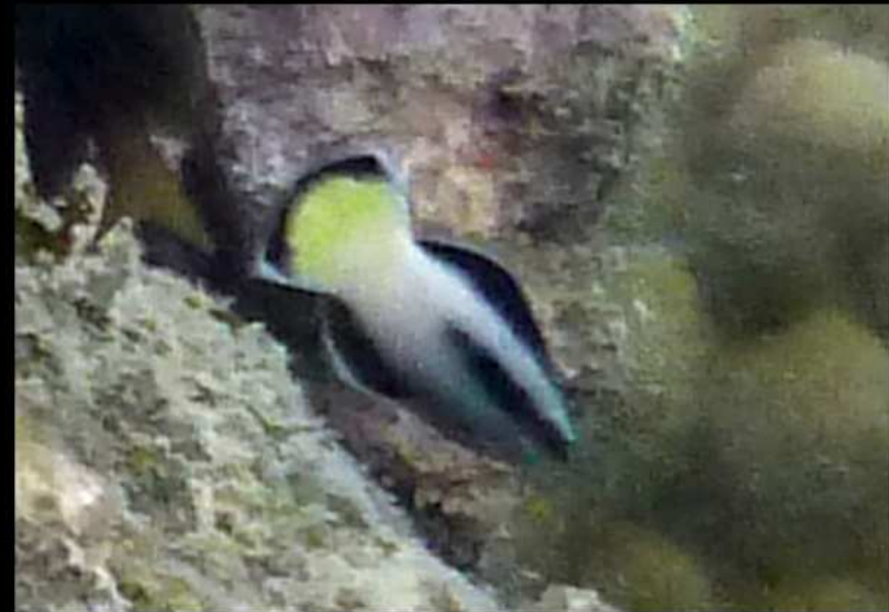
Labroides bicolor Zweifarb-Putzerlippfisch Bicolor cleaner wrasse juvenile 2014 Chumbe Island, Zanzibar