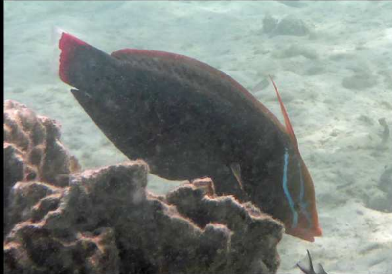
Coris formosa Indischer Clown-Junker Indian sand wrasse female 2016 Chumbe Island, Zanzibar