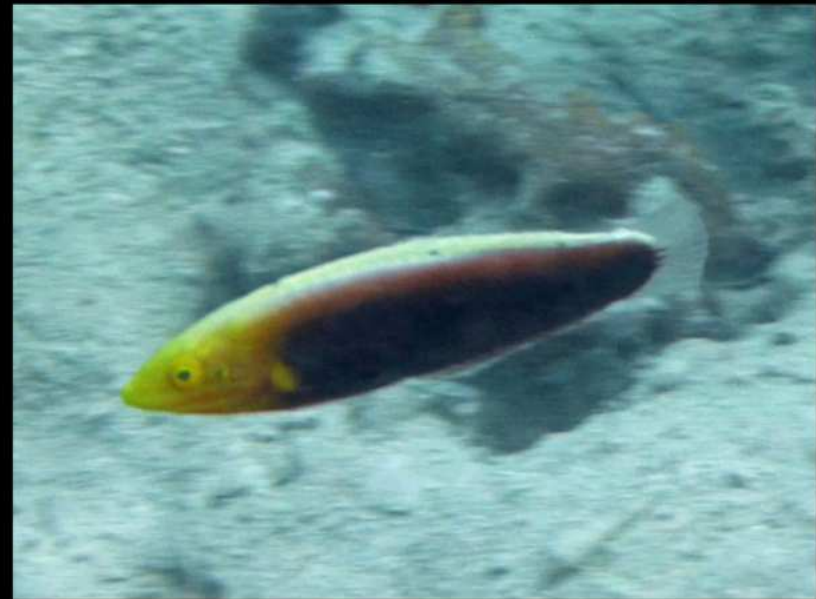
Halichoeres iridis