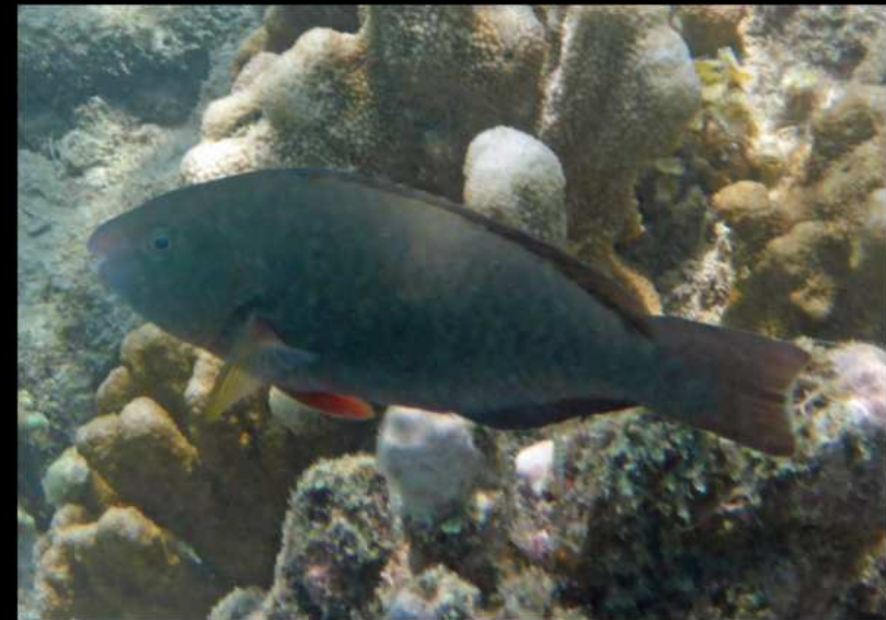
125 Scarus psittacus