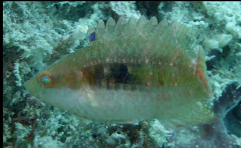
Oxycheilinus bimaculatus