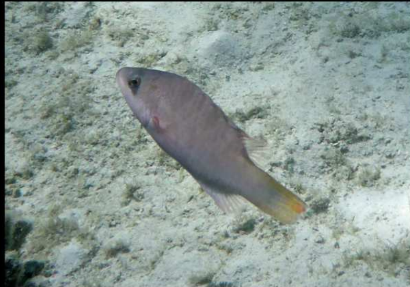
Oxycheilinus diagramma Wangenstreifen-Lippfisch juvenile Cheeklined splendour wrasse or Bandcheek wrasse juvenile 2016 Chumbe Island, Zanzibar