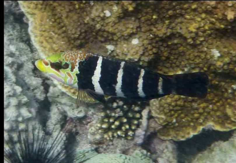
Hemigymnus fasciatus Streifenbanner-Lippfisch Barred thicklip wrasse or Blackedge wrasse 2012 Chumbe Island, Zanzibar