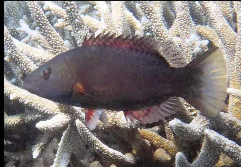
Oxycheilinus diagramma Wangenstreifen-Lippfisch male Cheeklined splendour wrasse or Bandcheek wrasse male 2020 Chumbe Island, Zanzibar