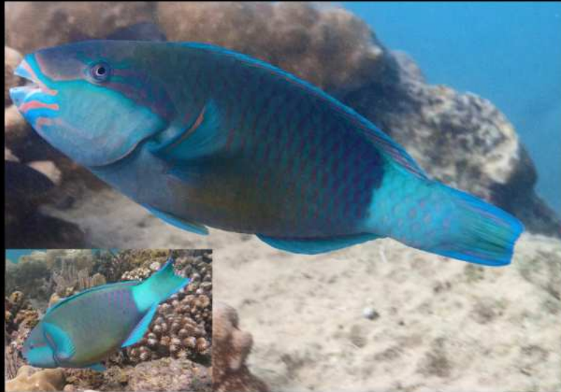
Chlorurus sordidus Kugelkopf-Papageifisch (männl.) Bullethead parrotfish (male) Daisy parrotfish 2013 Chumbe Island, Zanzibar