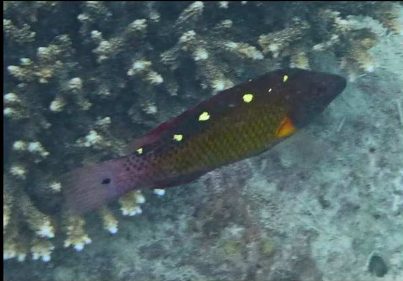
Bodianus diana Dianas Schweinslippfisch Diana's hogfish 2014 Chumbe Island, Zanzibar