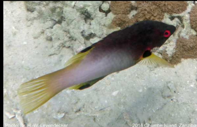
Chumbe Island, Zanzibar