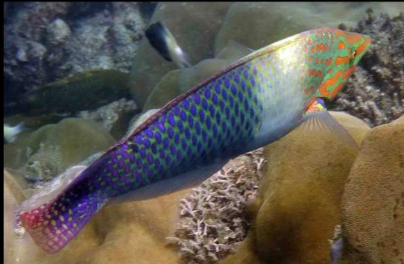
male 2016 Chumbe Island, Zanzibar