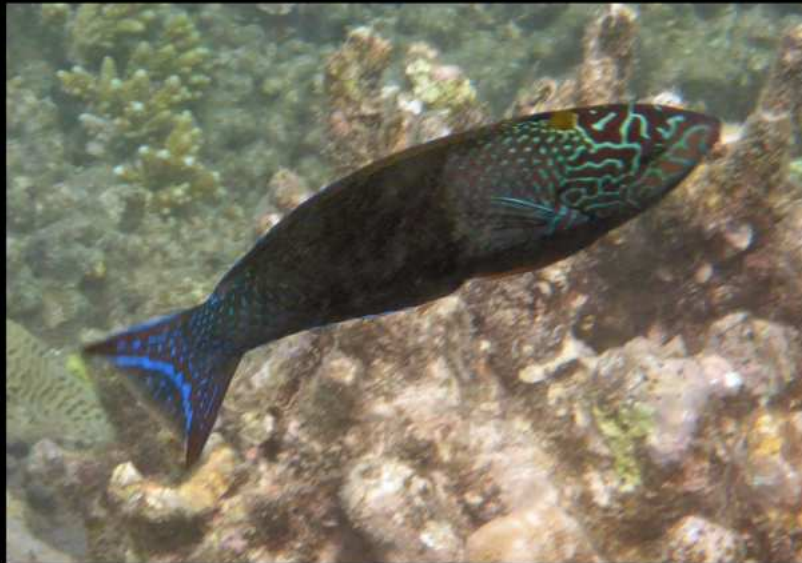
Anampses meleagrides Gelbschwanz Perlippfisch male Yellowtail tamarin or Chequered wrasse 2017 Chumbe Island, Zanzibar