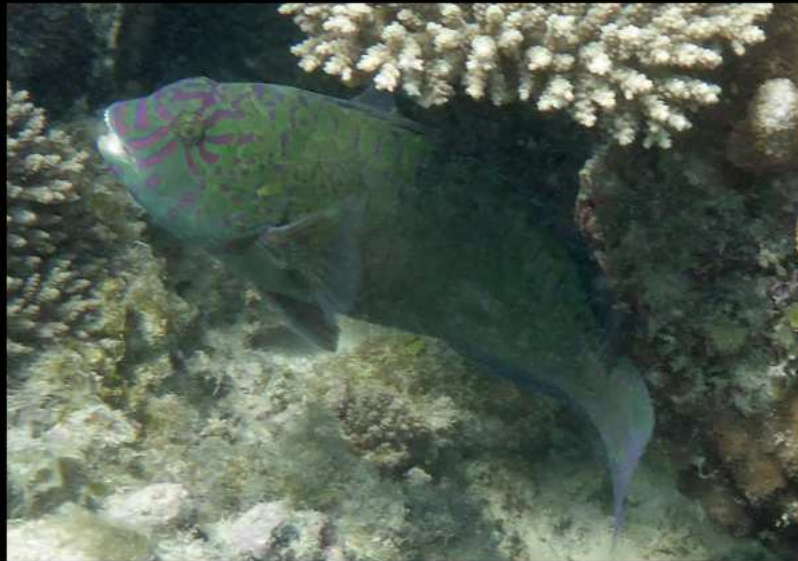
Calotomus carolinus male Stareye parrotfish or Carolines parrotfish Papageifisch 2016 Chumbe Island, Zanzibar