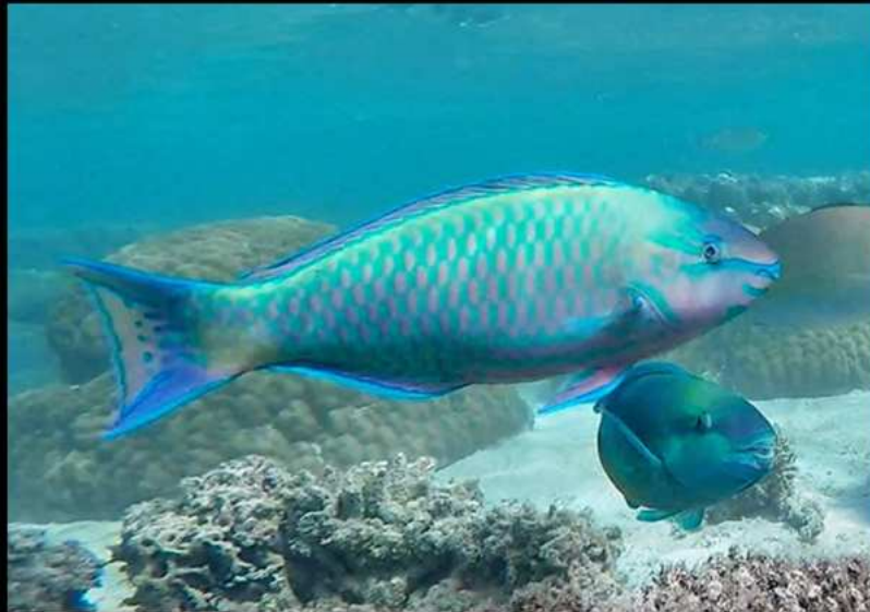
Scarus psittacus