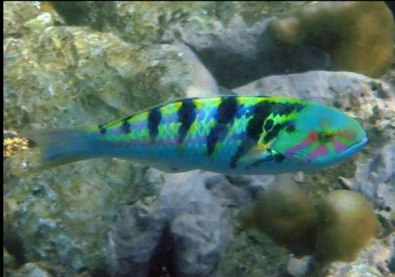
Thalassoma hardwicke