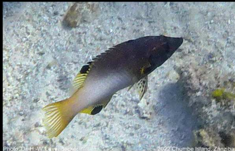
Chumbe Island, Zanzibar