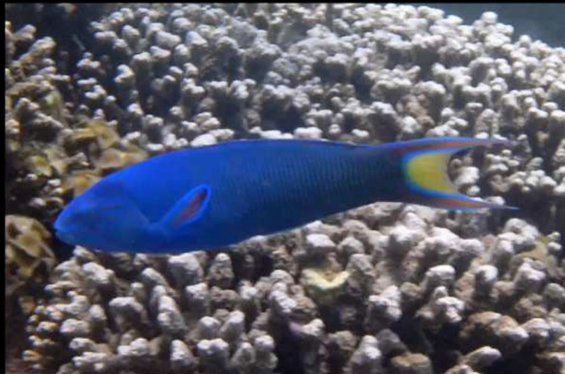
Thalassoma lunare Mondsichel-Junker Moon wrasse dominant male 2022 Chumbe Island, Zansibar