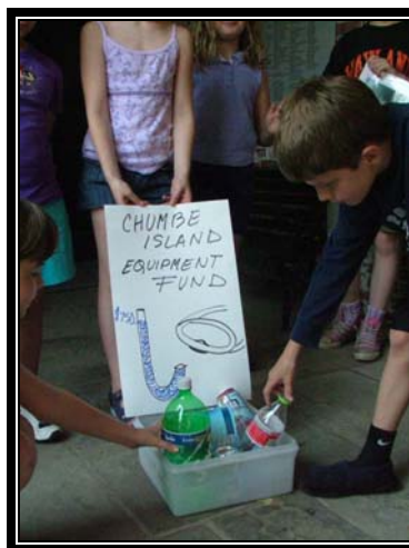
The Eliot Montessori School, Massachusetts, USA

The Education Programme was also presented with a solar radio courtesy of Freeplay as part of the Mambo Elimu Education project ( http://www.tenzero.net/~freeplay/displayarticles.php?id=82 )