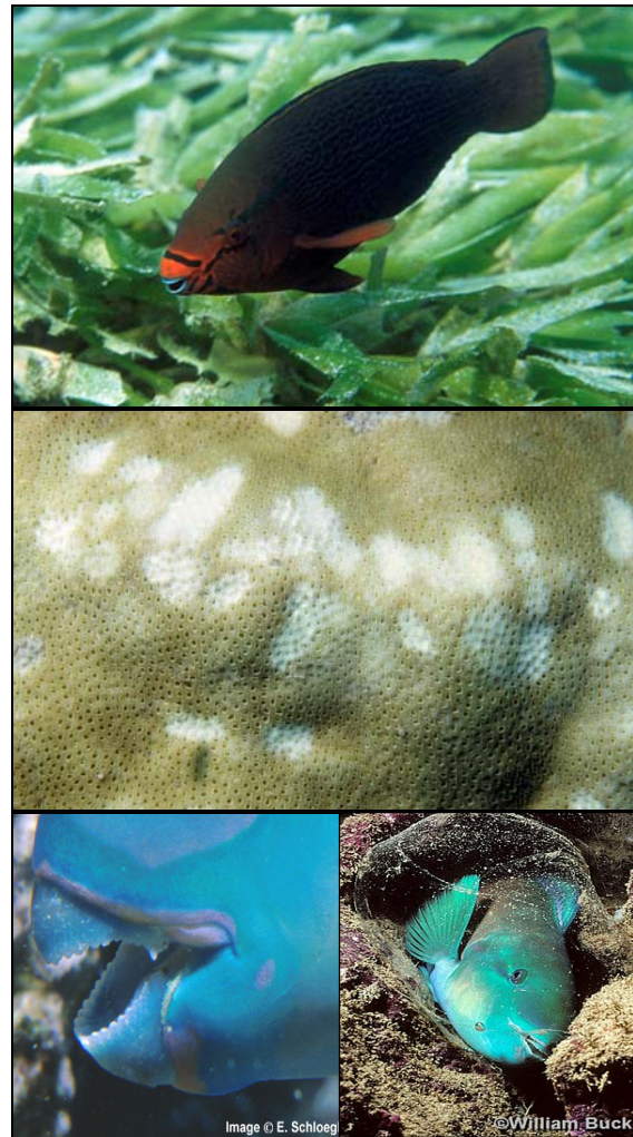
Fig. 1. Parrotfish are a diverse family of fish with a world wide distribution. Their name originates from their parrot-like mouth, shaped as a beak. Parrotfish are diurnal implying activity only during days and can be found sleeping in caves and holes covered by a mucus cocoon at night. Parrotfish are sex-changing species and go through three life phases all followed by a different colour phase. The upper photo showing Scarus niger (initial phase). Middle photo showing parrotfish bite marks on live coral. Below to the left: parrotfish jaw. Below to right: sleeping parrotfish in mucus cocoon.

Protected marine environments are beneficial tools in the attempt of having sustainable ecosystems. The advantages gained from protected areas can also be seen in adjacent reefs and has proven to increase the fish catches and creating new sources of income (eco-tourism etc). Management of an open resource, such as coral reefs, is tricky. Restrictions and regulations may exclude people from doing what they have always done and may not always be welcomed. But protections are needed to create a sustainable environment which can act as source for food and income in decades to come.